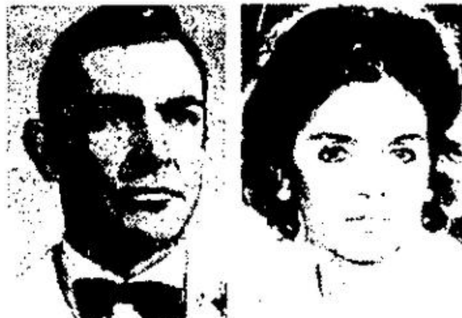
Sean Connery Millie Perkins

A. This one will have to go to arbitration. Sean Connery was the first Bond on the big screen. But there was a CBS-TV version of "Casino Royale" on "Climax Mystery Theater" on Oct. 21, 1954, with Barry Nelson as Bond. Peter Lorre was the villain on that telecast and Linda Christian the first Bond girl.