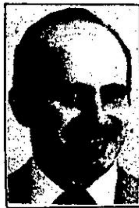
Bob Spence Entertainment Thomson News Service

For 10 straight Sundays, CBC Radio is offering a blend of music and humor distilled from music festivals across Canada.