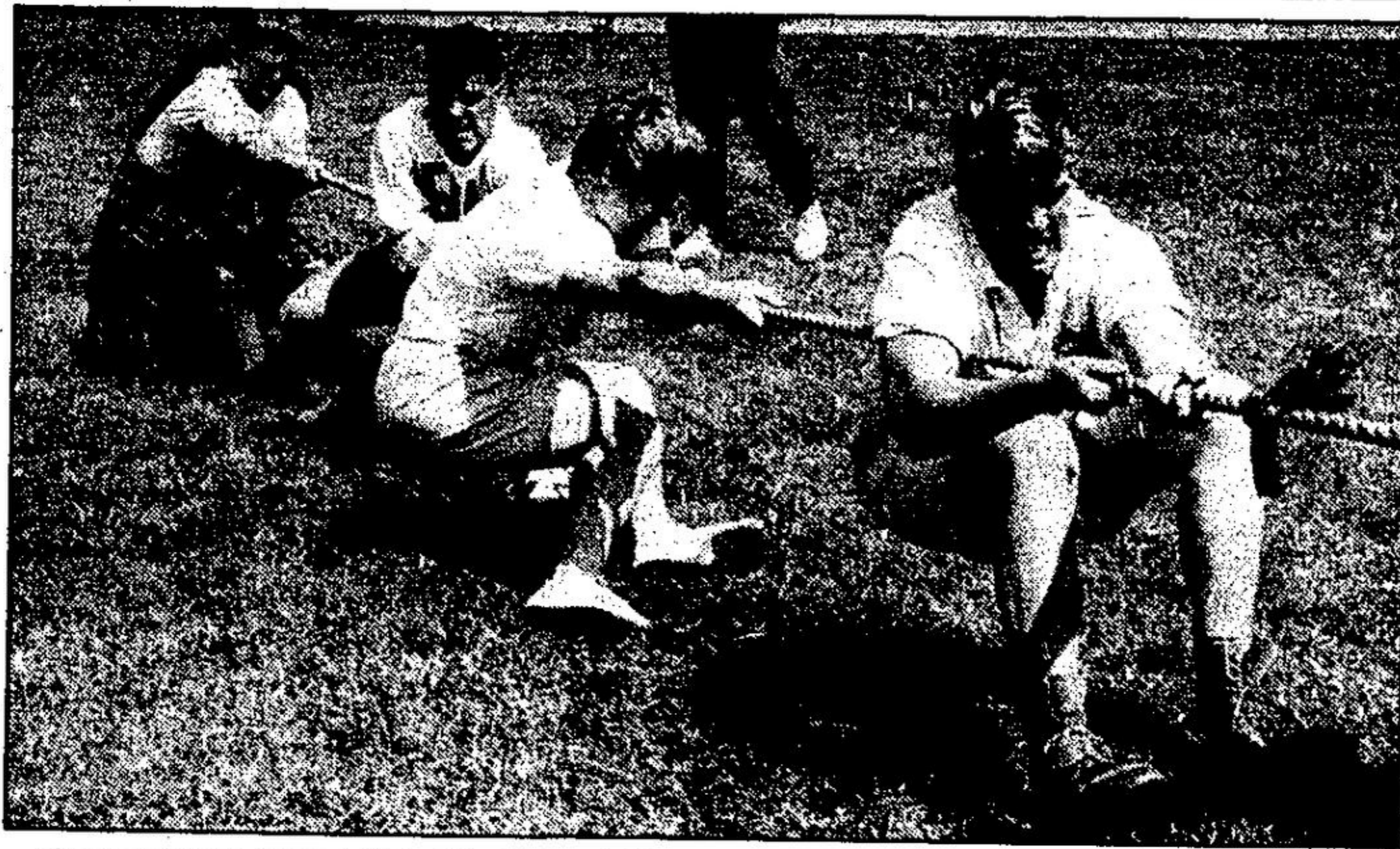
The Georgetown District High School Tug of War team didn't fare too well in the Highland Games competition. Although only three teams entered the event, the GDHS squad was eliminated in the