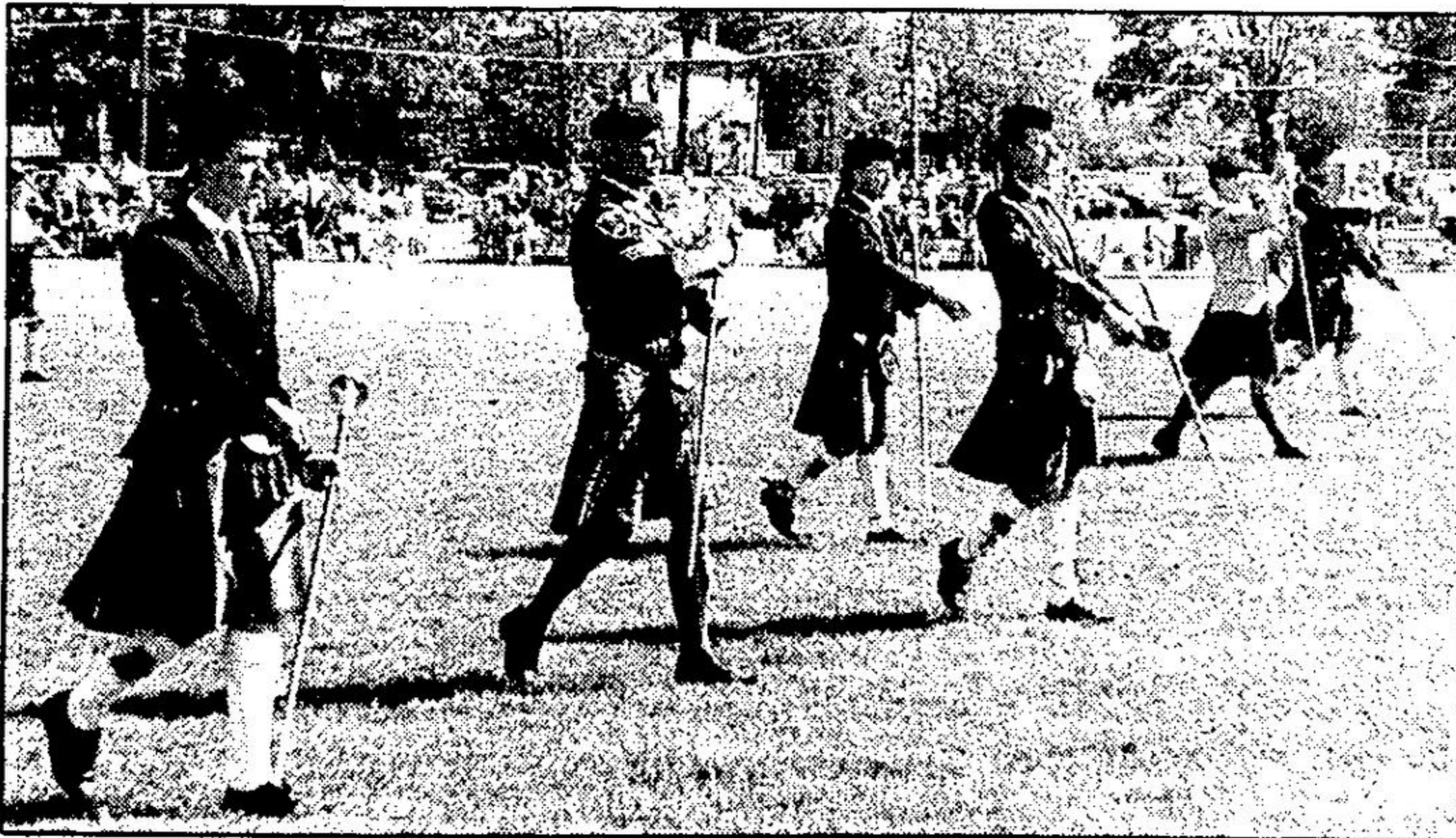
The Drum Majors competition was held late Saturday afternoon as the 15th Annual Scottish Festival and Highland Games wound down at Georgetown's

Fairgrounds. Despite the lateness of the event, those still in attendance were thrilled by the panache of the various Drum Majors.