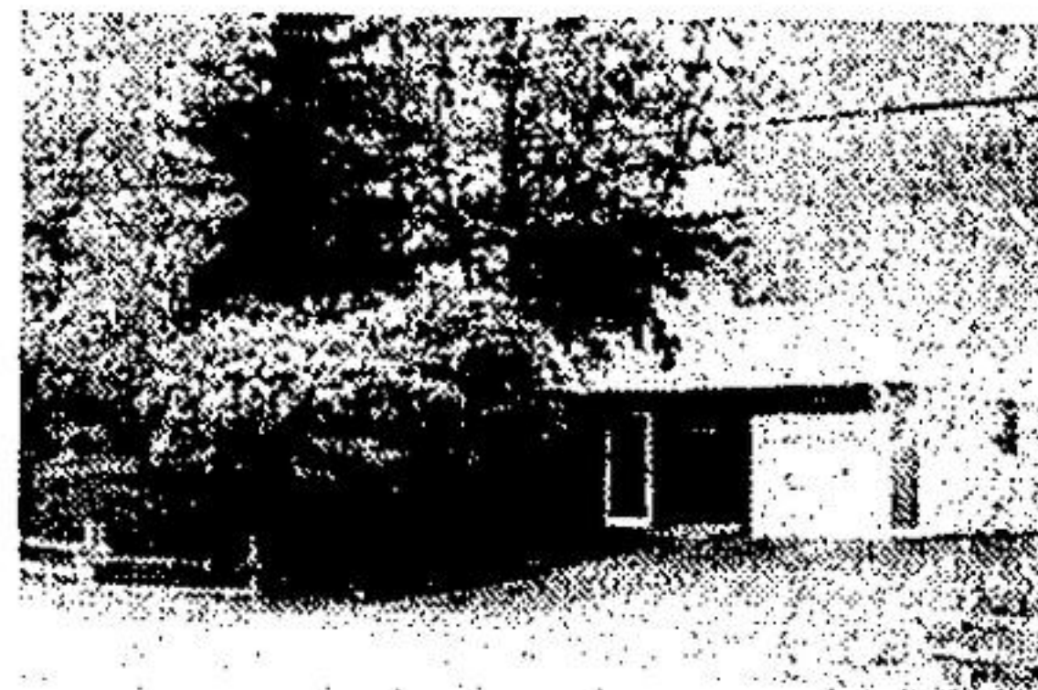
242 MAPLE AVE. GEORGETOWN

LOVELY 3 BEDROOM SIDE-SPLIT CLOSE TO DOWNTOWN. LARGE MATURE TREES AND NEXT DOOR TO THE PARK.