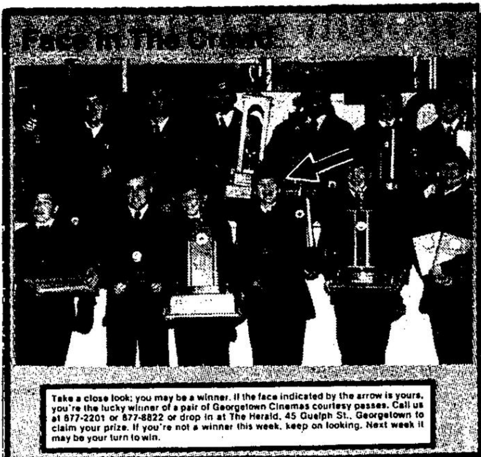
Take a close look; you may be a winner. If the face indicated by the arrow is yours, you're the lucky winner of a pair of Georgetown Cinemas courtesy passes. Call us at 877-2201 or 877-8822 or drop in at The Herald, 45 Guelph St., Georgetown to claim your prize. If you're not a winner this week, keep on looking. Next week it may be your turn to win.