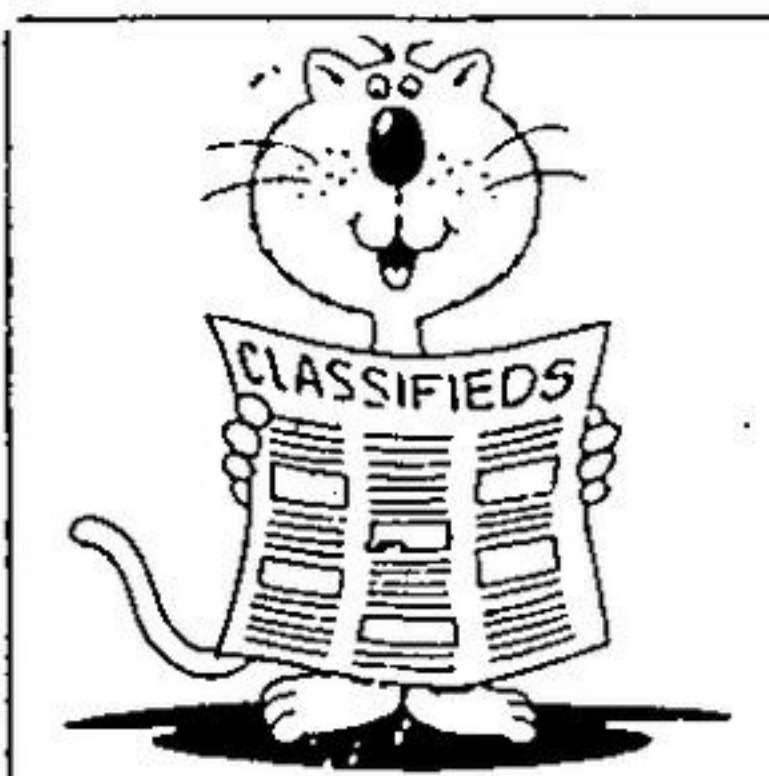
Be A Cool Car And Check Out the Savings in the Classified Section.

Meanwhile, the House administration committee has approved the purchase of a large diesel truck for $48,000. It's needed to haul congressmen's freebie mailings between rented warehouse space and the House mail room.