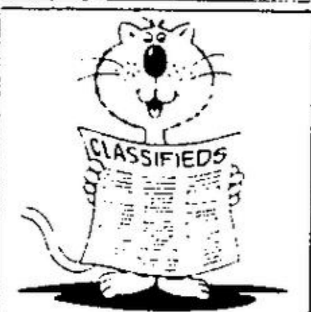
Be A Cool Cat And Check Out the Savings in the Classified Section

550K Honda, good condition $750.00. Phone 877-6240.(es)