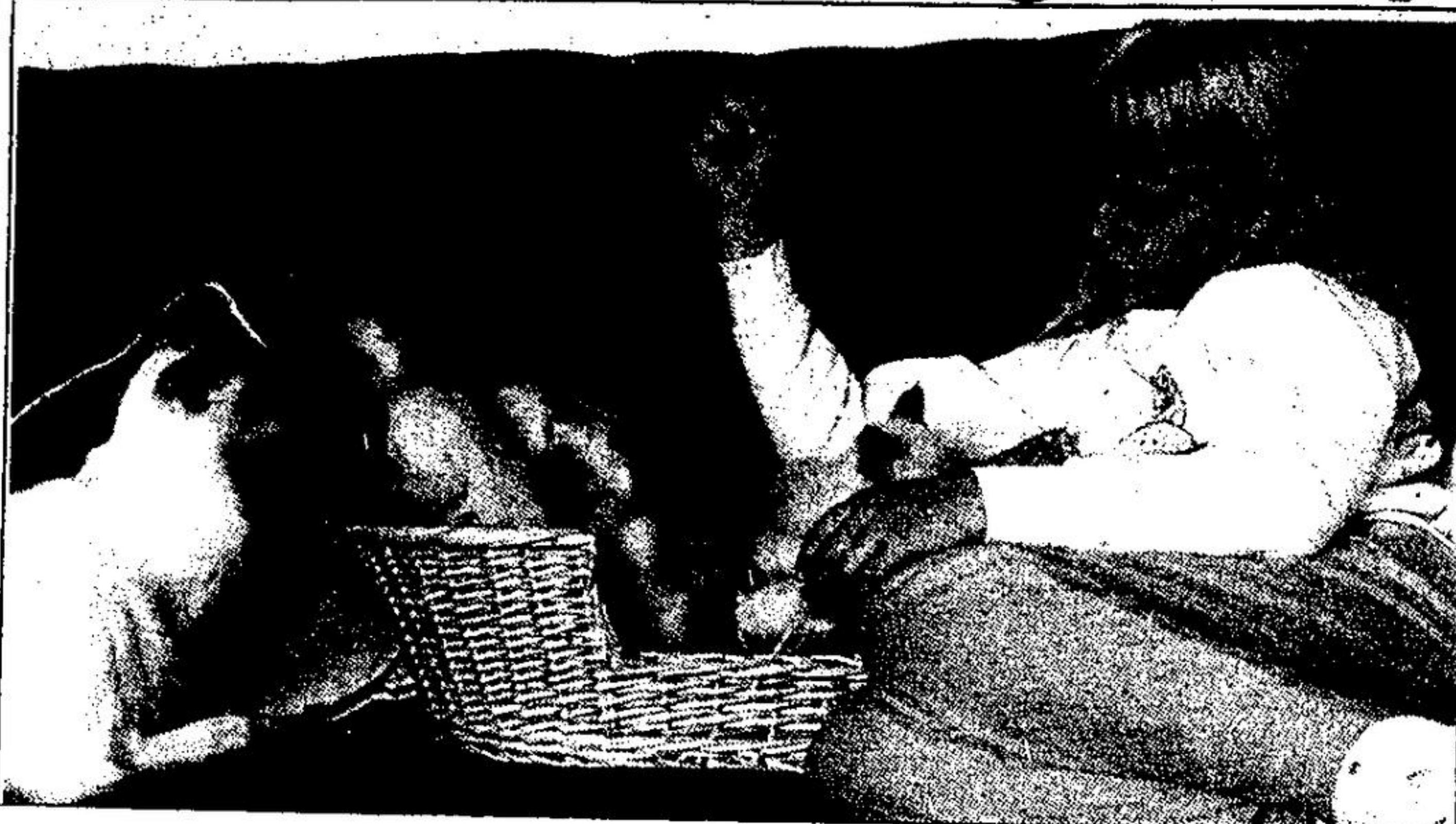
Snuggling up with a basket full of kittens is an easy way to relax. These are five of the kittens that Madge Turner, Balinese cat breeder, will be selling shortly.

Viewing Ms. Turner's cats will be relatively easy since they will be at the May 27 "No Name Cat