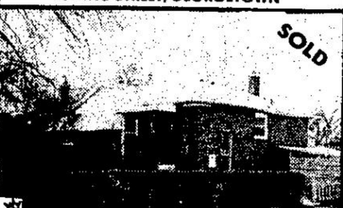
2 CLEAVEHOLM, GEORGETOWN