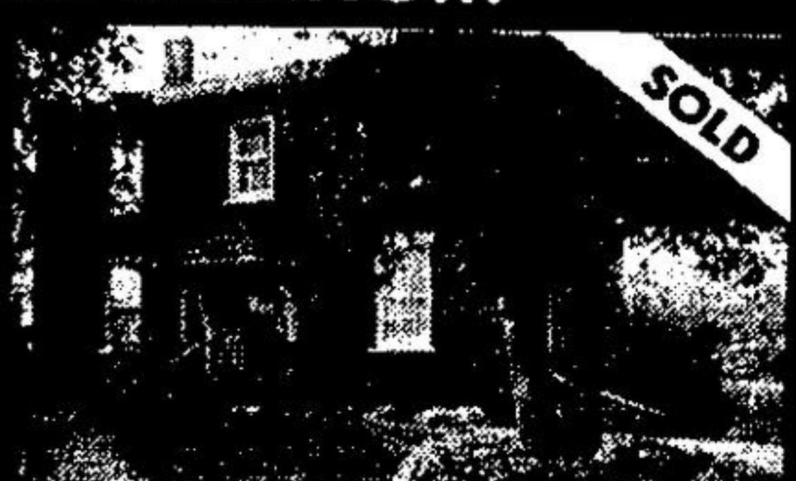
5 CLEAVEHOLM, GEORGETOWN