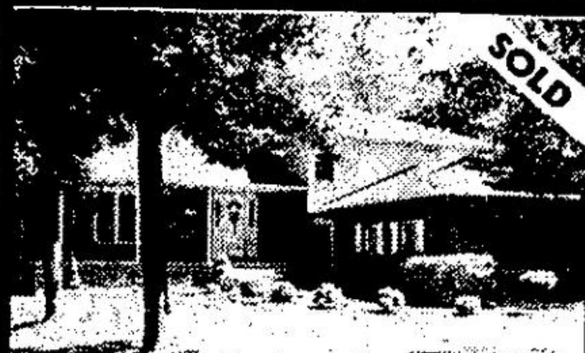
6th LINE, GEORGETOWN