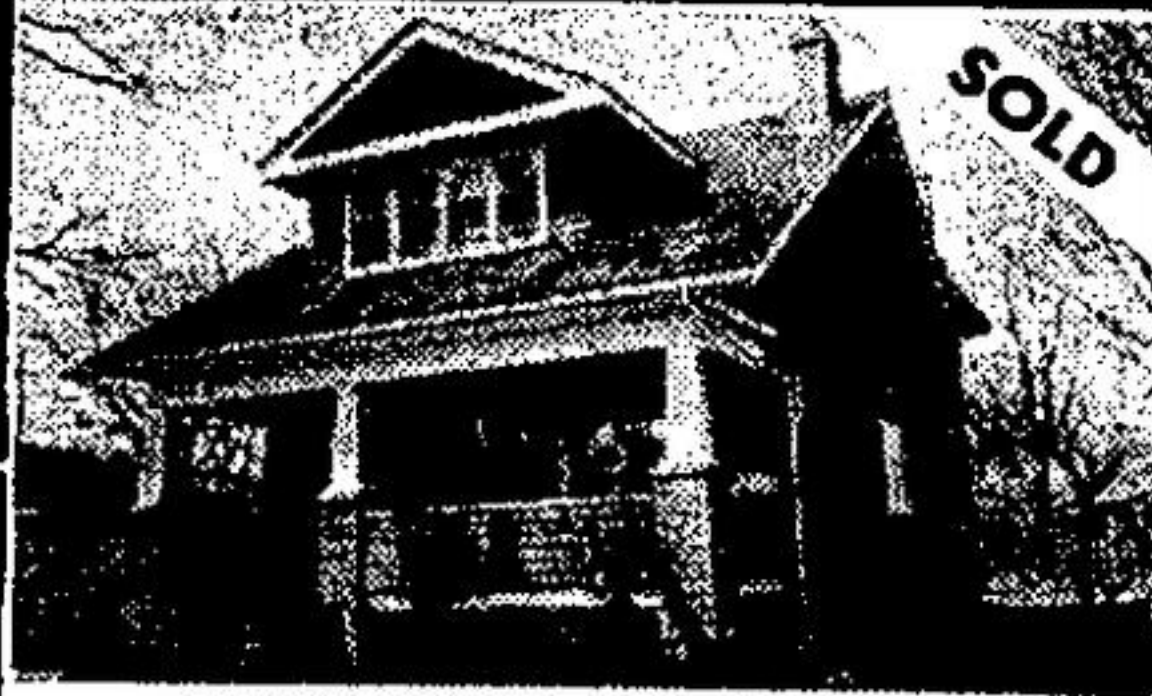
25 KING STREET, GEORGETOWN