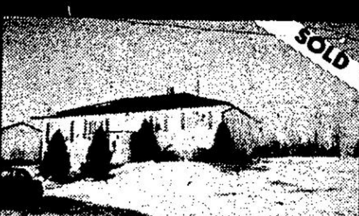
R.R. 5, ERIN