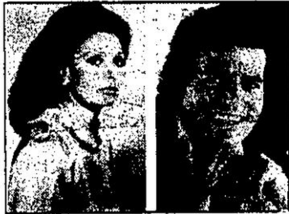
Sophia Loren Patrick Wayne

A. Everybody should know it by now — Engelbert is really Arnold Dorsey.