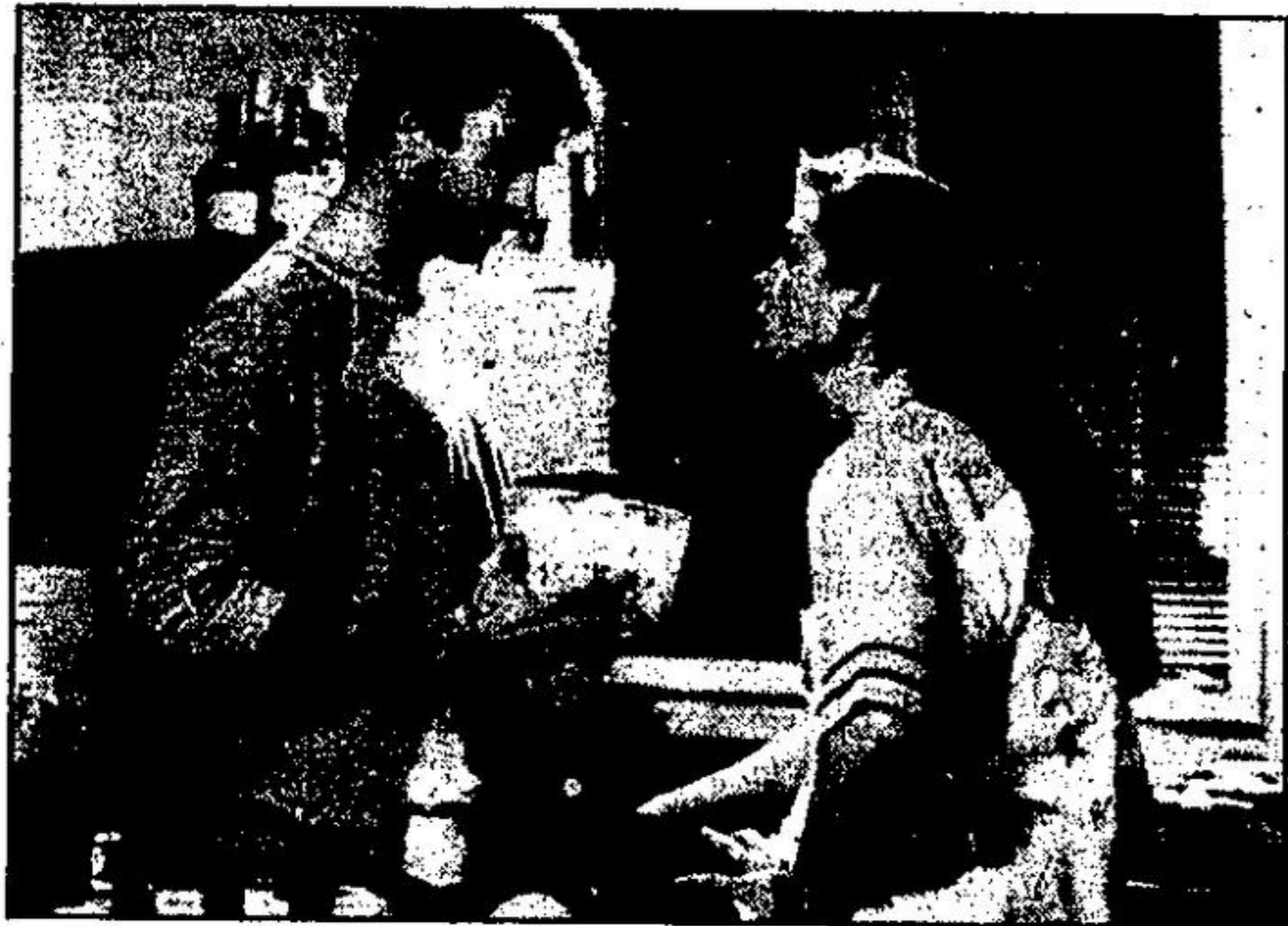
LOTTIE MASON (Theresa Russell) is an undercover cop whose life is complicated when she becomes romantically involved with District Attorney Stan Harris (Jeff Fahey) in the psychological thriller "Impulse."

When characters in a movie behave stupidly simply to further the storyline (to get themselves in jams, the better to scare us), intelligent viewers rebel. Accordingly, there were groans and titters coming from the audience during moments of this movie. Still, that one stays with "Impulse" even