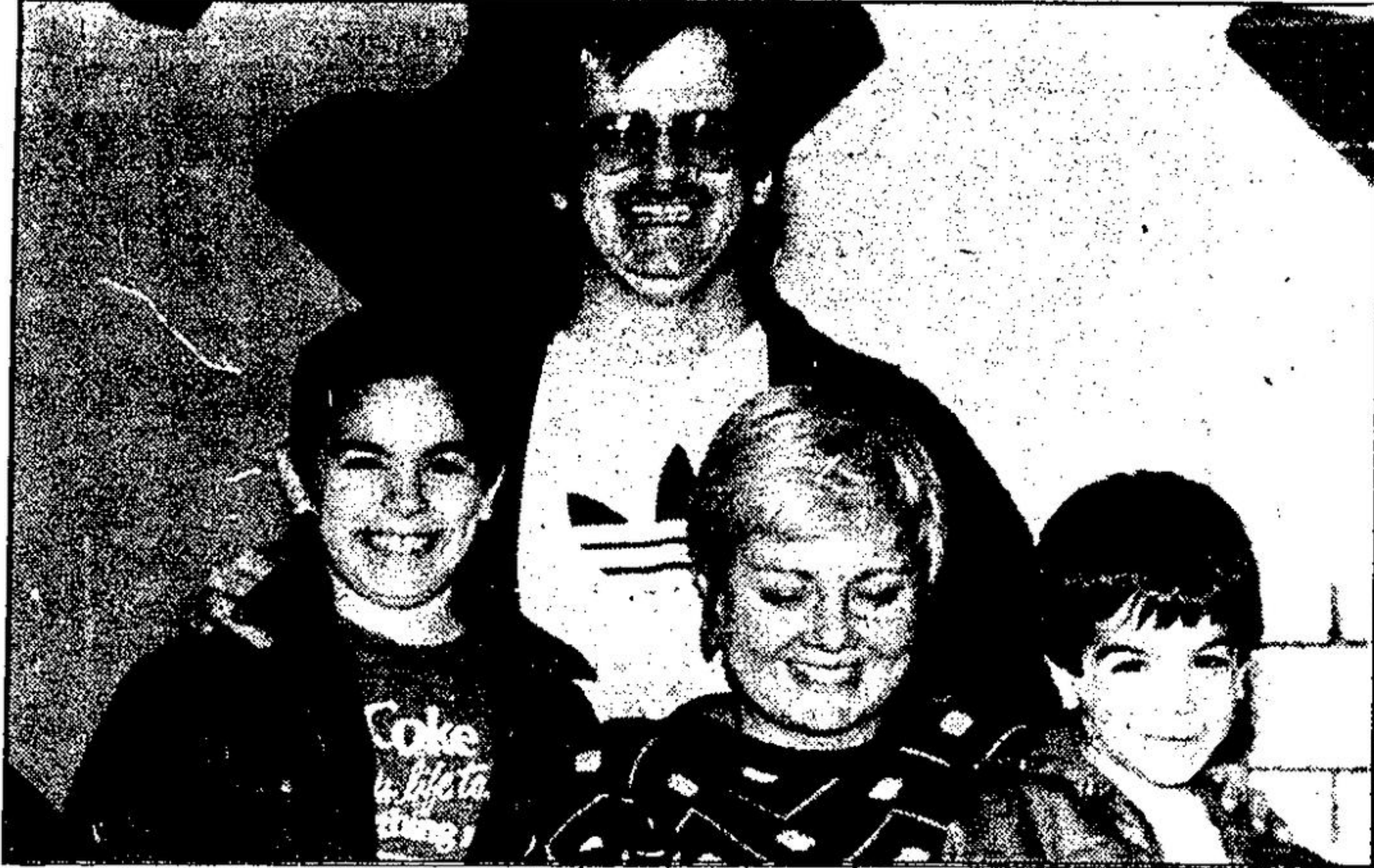
All in the family