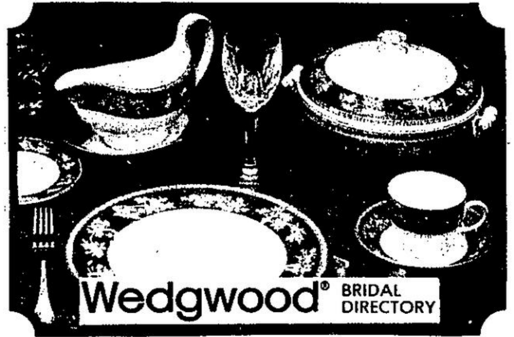
Wedgwood ® BRIDAL DIRECTORY