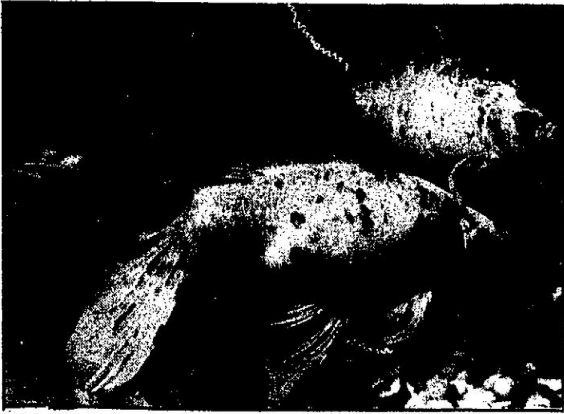
GOLDFISH AQUARIUMS are easy to set up, require minimal maintenance and provide a rewarding hobby for the entire family.

The arrival of spring signals that we will soon be enjoying the beauties of nature—blooming flowers and greening shrubs and trees.