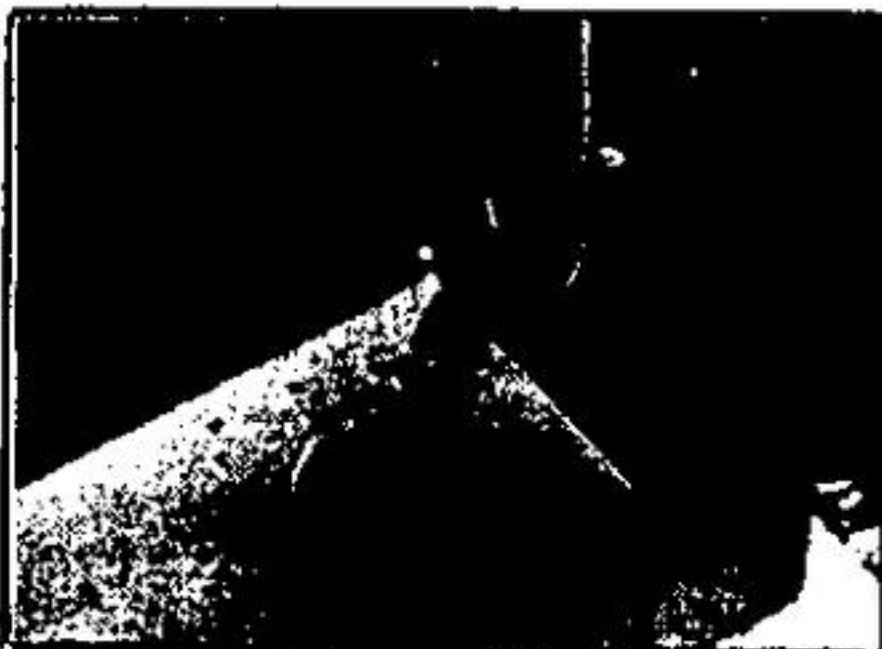
Step 4: Attach the stainless steel tubing provided with the new stationary gas barbecue to the existing gas line using a flare fitting.

grills primarily because of its patented Flavorizer® System, which replaces old-fashioned lava rock or pumice stone. Angled bars direct cooking fats away from the meat while effectively vaporizing juices and drippings for real barbecue flavor, and help prevent flare-ups caused by porous, grease-collecting lava rock.