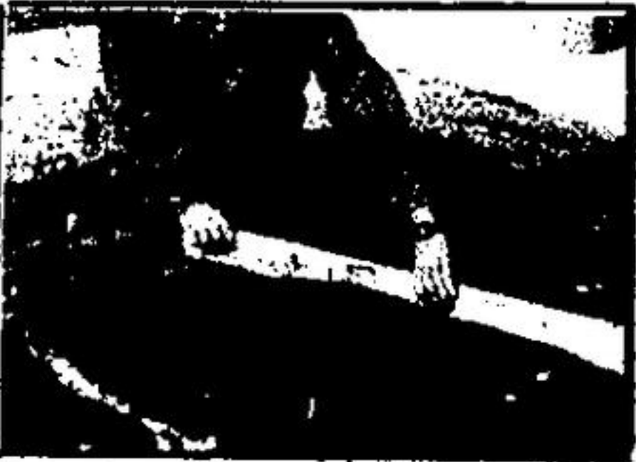
Step 2: Fill the rectangular form with approximately 2½-3 bags of mixed concrete. Level and allow fresh concrete to dry completely.