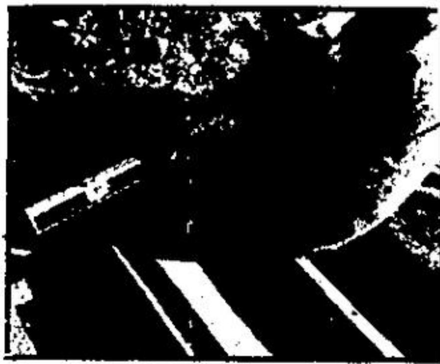
Step 3: Level the grill base on the concrete slab with a standard bubble level. Then drill holes in the concrete and bolt grill base to the slab.