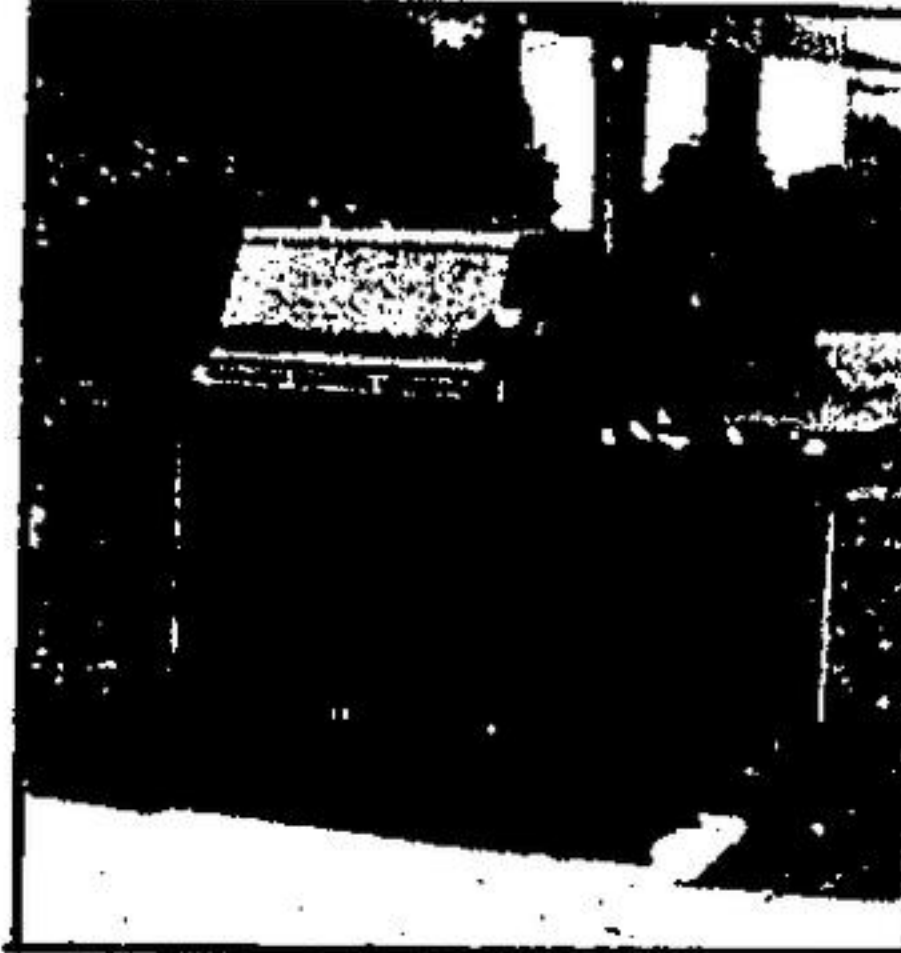
Step 5: Attach the Genesis Perma-Mount Gas Barbecue from Weber-Stephen Products Co. to the grill base (follow the instructions in the owner's manual enclosed with the grill). Turn on the gas and leak-check all gas connections. Relax and grill a delicious barbecued meal to celebrate a job easily done!