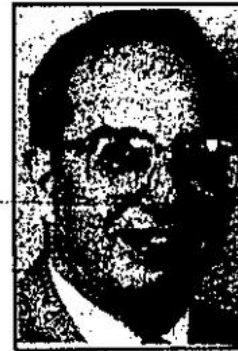
Walt Elliot MPP Halton North LIBERAL

The fire at the Hagersville storage site has served as an object lesson for all concerned. In acting quickly the Ontario government has served notice that it will no longer tolerate delays in cleaning up the potential hazard that huge piles of used tires represent.