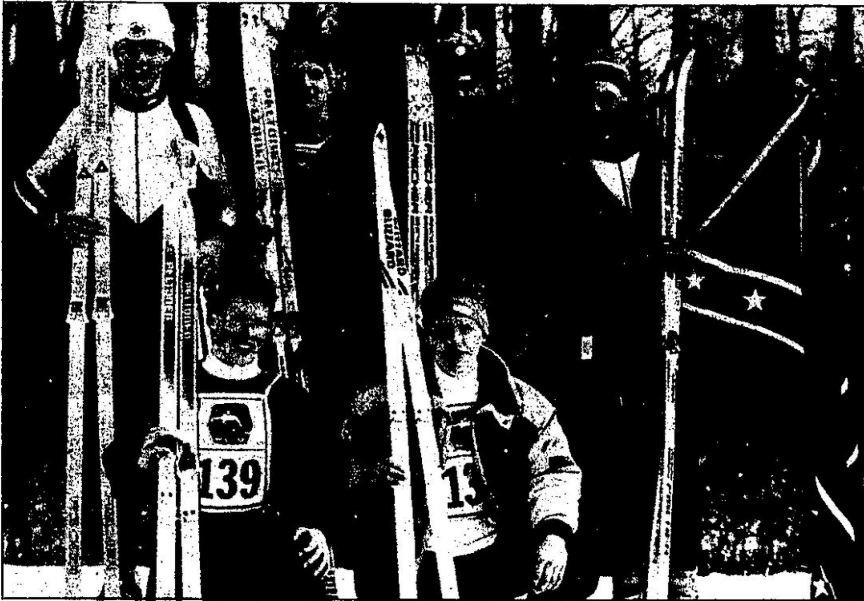
THE GDHS REBELS Nordic ski team is headed for Sudbury this weekend to compete in the interscholastic provincial championship to be staged just off the campus of Laurentian University. Fresh from a Golden Horseshoe Athletic Conference crown, the Rebels have high hopes of doing well at the OF-