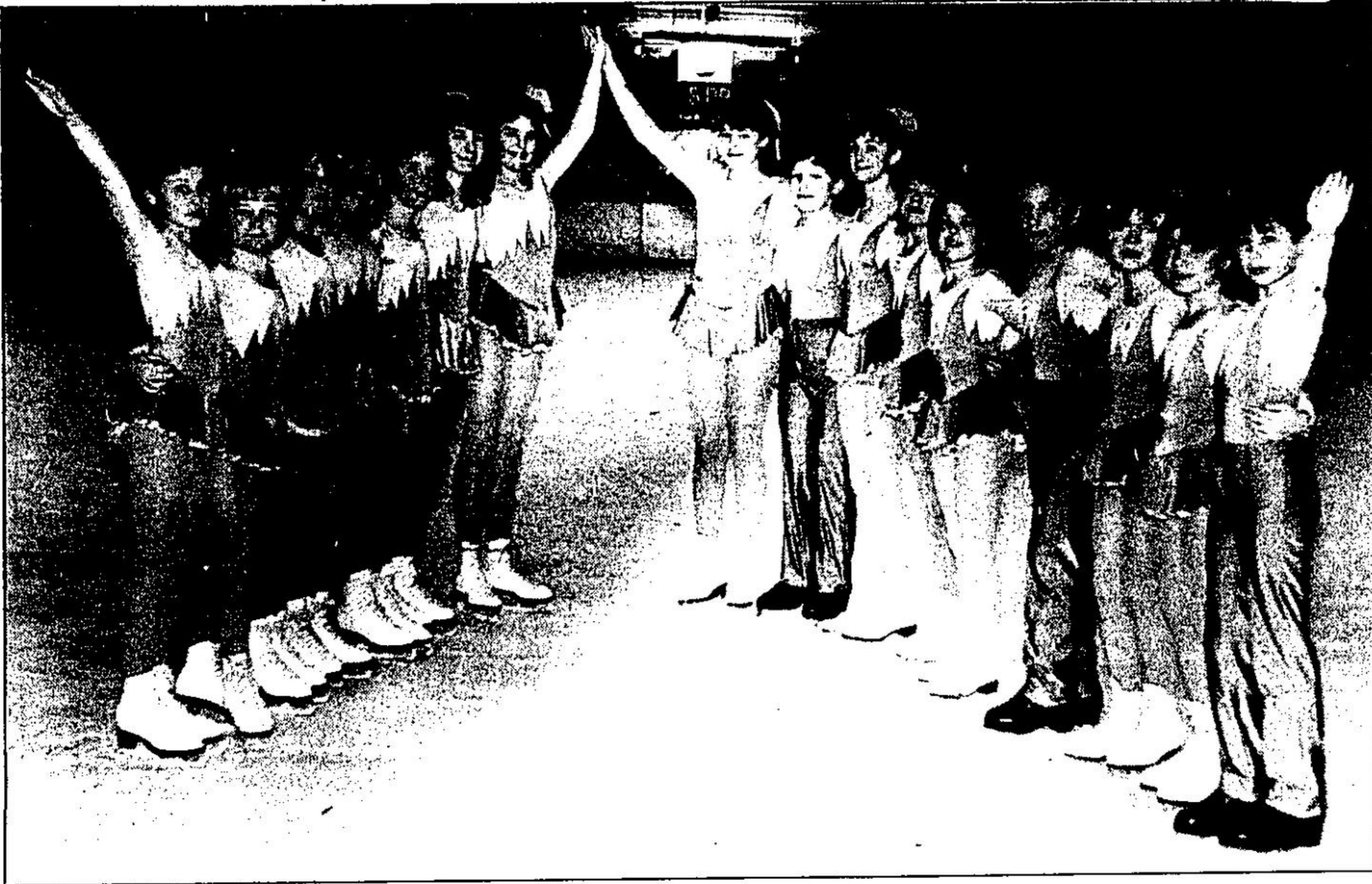
GFSC Juvenile Precision Skating Team