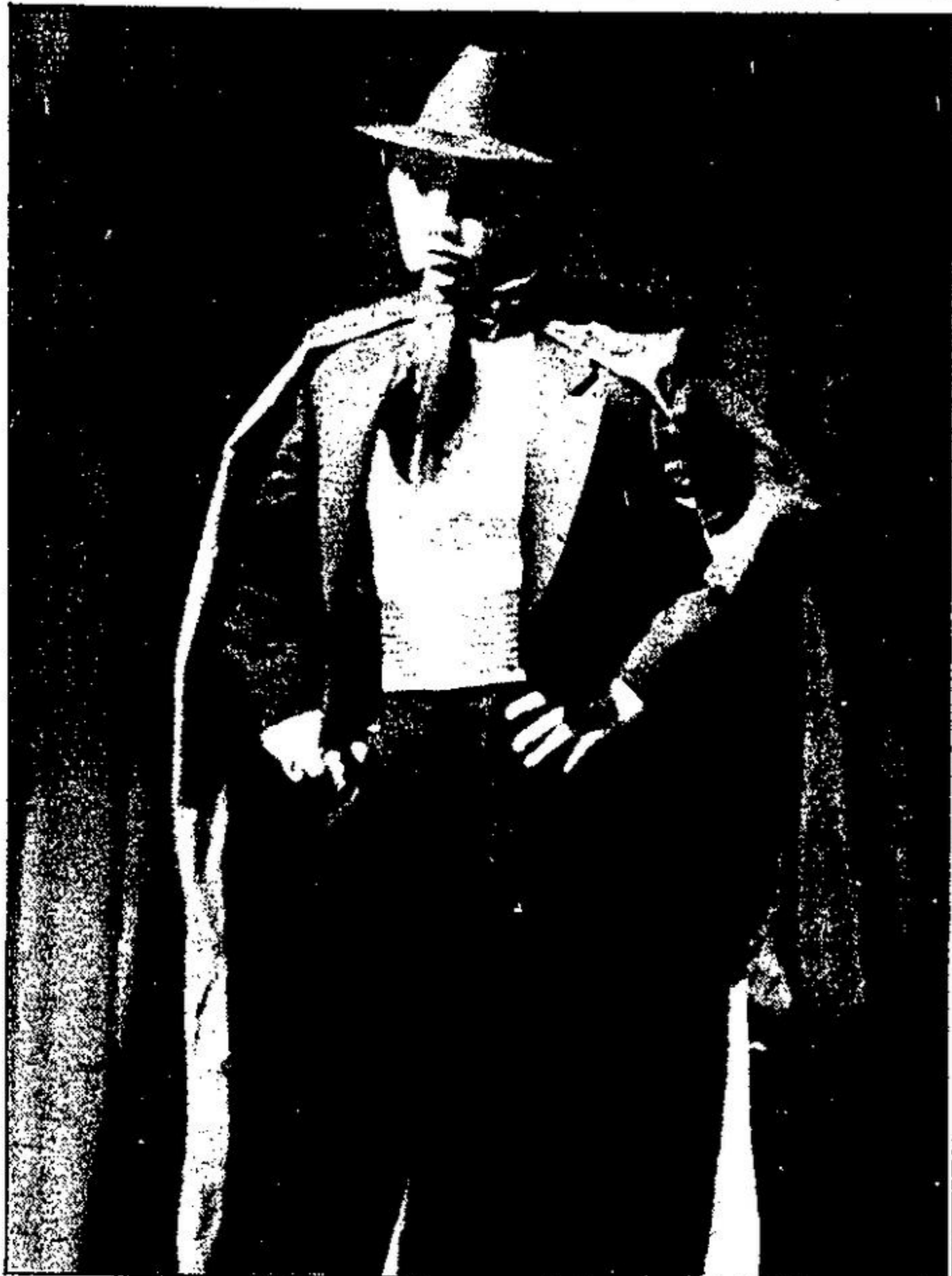
The Madonna Bridal Spring Fashion Show for 1990 wasn't without drama, at Bishop Reding High School in Milton, Sunday. Here a model decked out in a Phantom of the Opera costume is about to introduce several models displaying a selection of lingerie to the theme music of the popular opera.