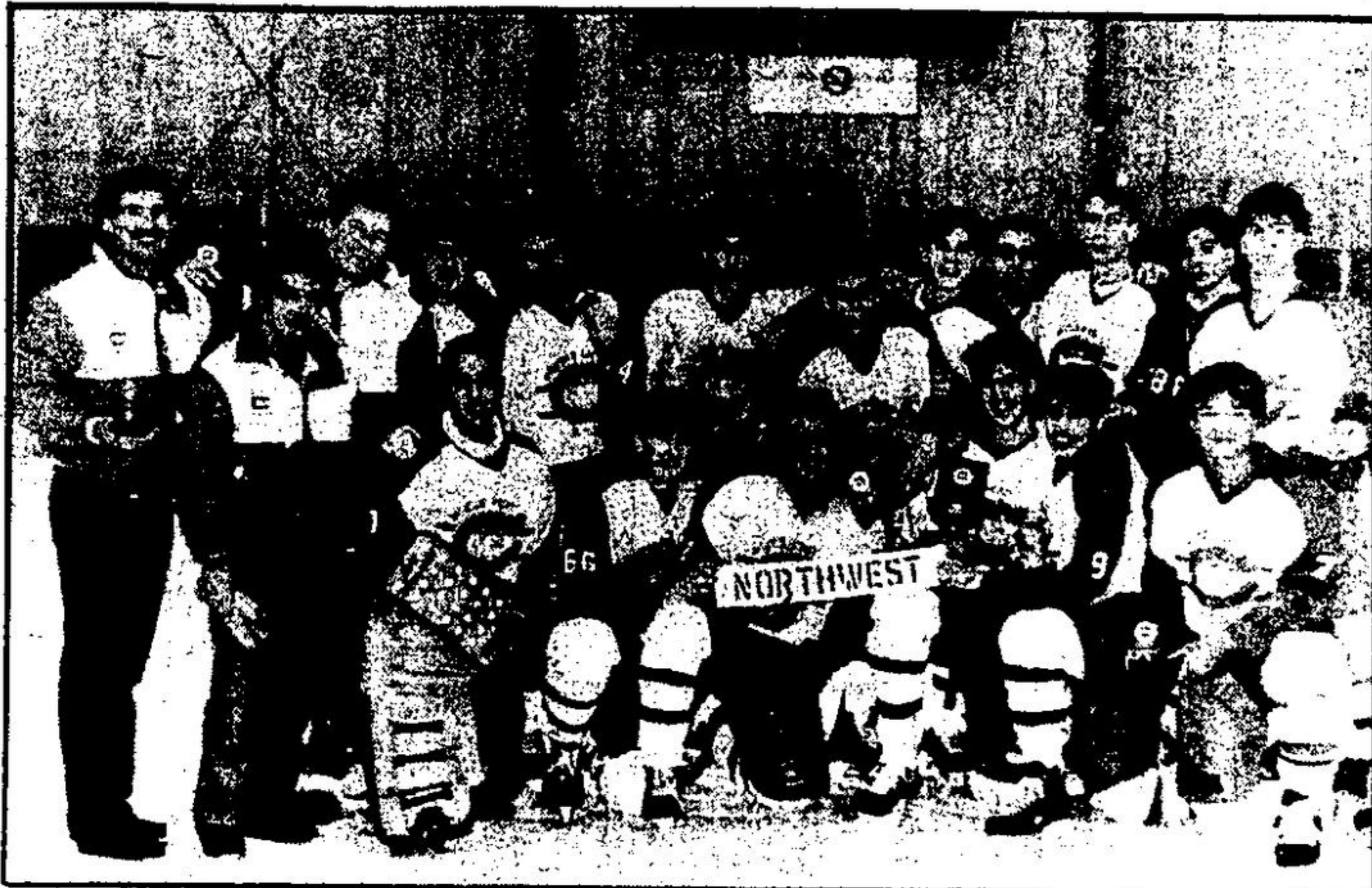
Northwest - Consolation Champion