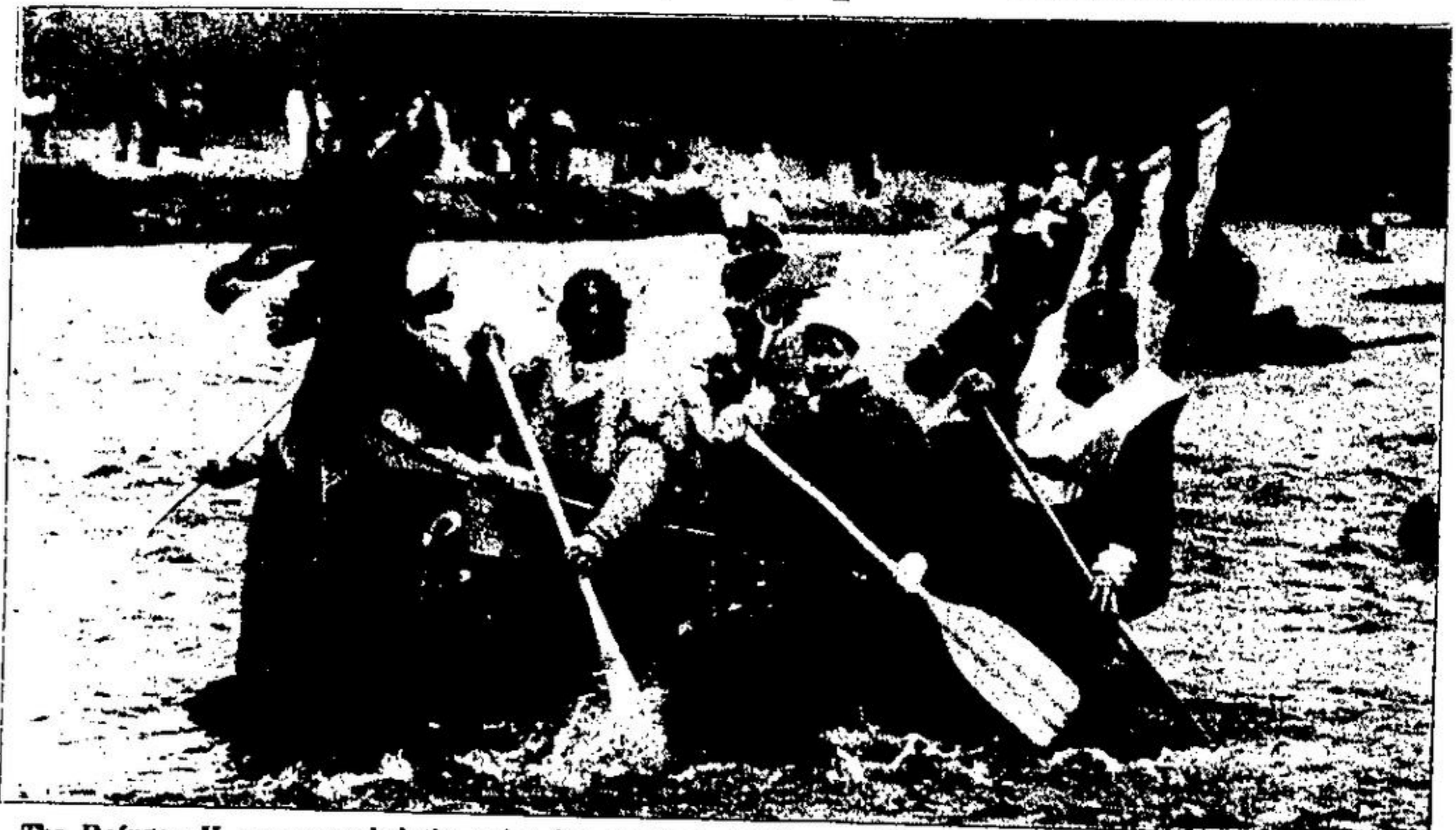
The Refugee II was awarded the prize for craziest boat to cross the finish line at the 23rd annual Lions Club Crazy Boat Race down the Credit River to Glen Williams. Almost 60 boats and 12 canoes sailed, scrambled or sank in the frigid waters to raise more than $10,000 for multiple sclerosis.

She added that the Acton site also contains shale, which would let contaminated water leak through the site into the soil.