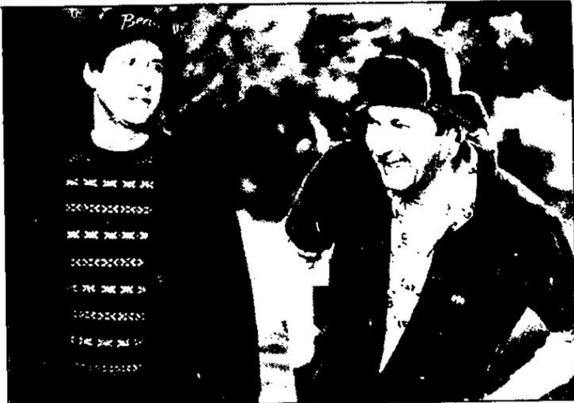
CLARK GRISWOLD (Chevy Chase) tries to create the perfect Christmas experience for his family when his country cousin Eddie (Randy Quaid) shows up in "National Lampoon's Christmas Vacation."

The third in the series offers a malicious twist on the first two: The Griswolds are planning to spend a nice