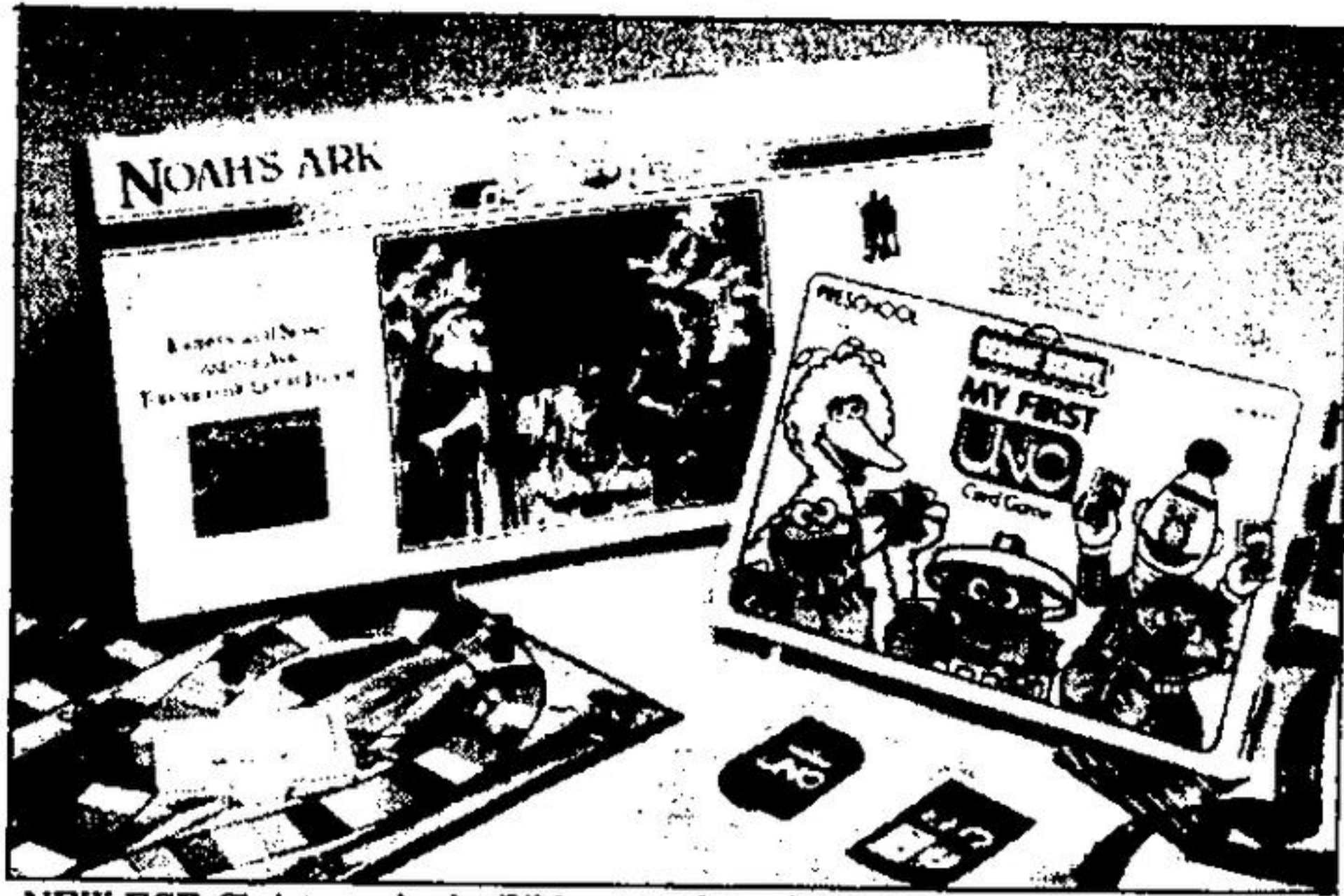
NEW FOR Christmas is the Bible story board game Noah's Ark (about $10), for those 7 and older. Ages 3 and up will enjoy My First UNO with Sesame Street characters (about $6).