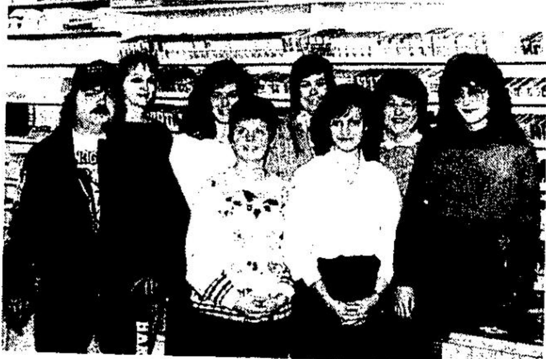
Season's Greetings From All Of Us!

Our thanks for the many kindnesses you've shown us through the year!