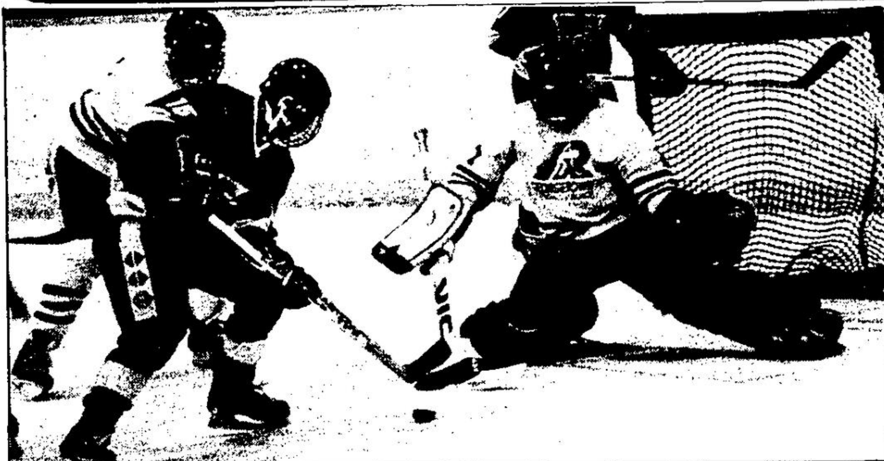
GOALTENDER CURTIS GREEN might be justified in feeling a bit shell-shocked following the two most recent losses of the Georgetown Pontiac-Buick Raiders. Green might have had just cause in suing his mates for non-support following the 12-1