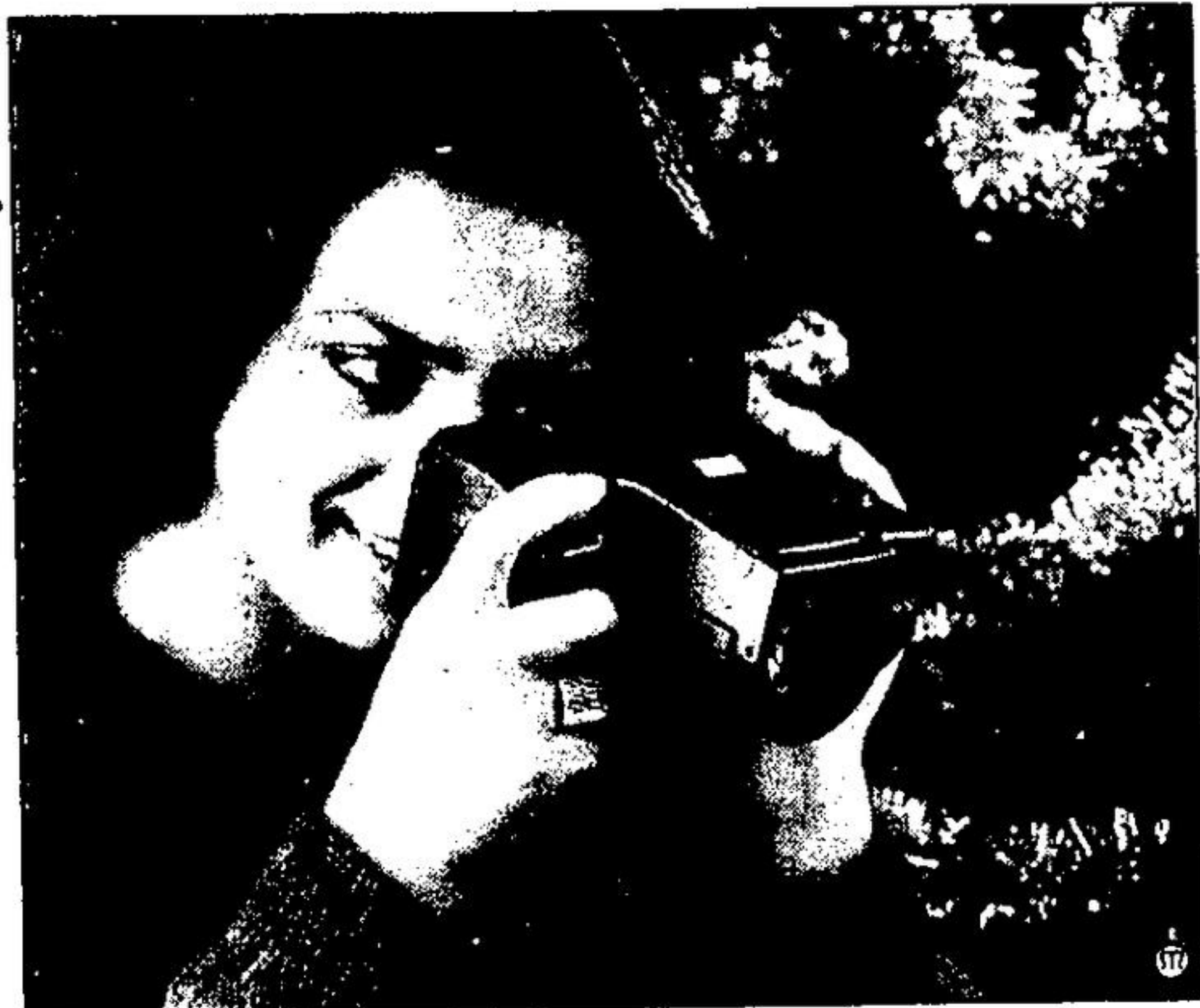
MAY ALL YOUR MEMORIES BE BRIGHT...AND SHARP! Close-ups, wide angle group shots and anything in-between are point-and-shoot easy with the high-tech Ricoh Mirai, a great gift for a very special someone.

This Christmas, and for all the Christmases to come, the gift of fragrance is one that will be appreciated, used and remembered. That's because fragrance is one of the most personal gifts a person can give or receive!