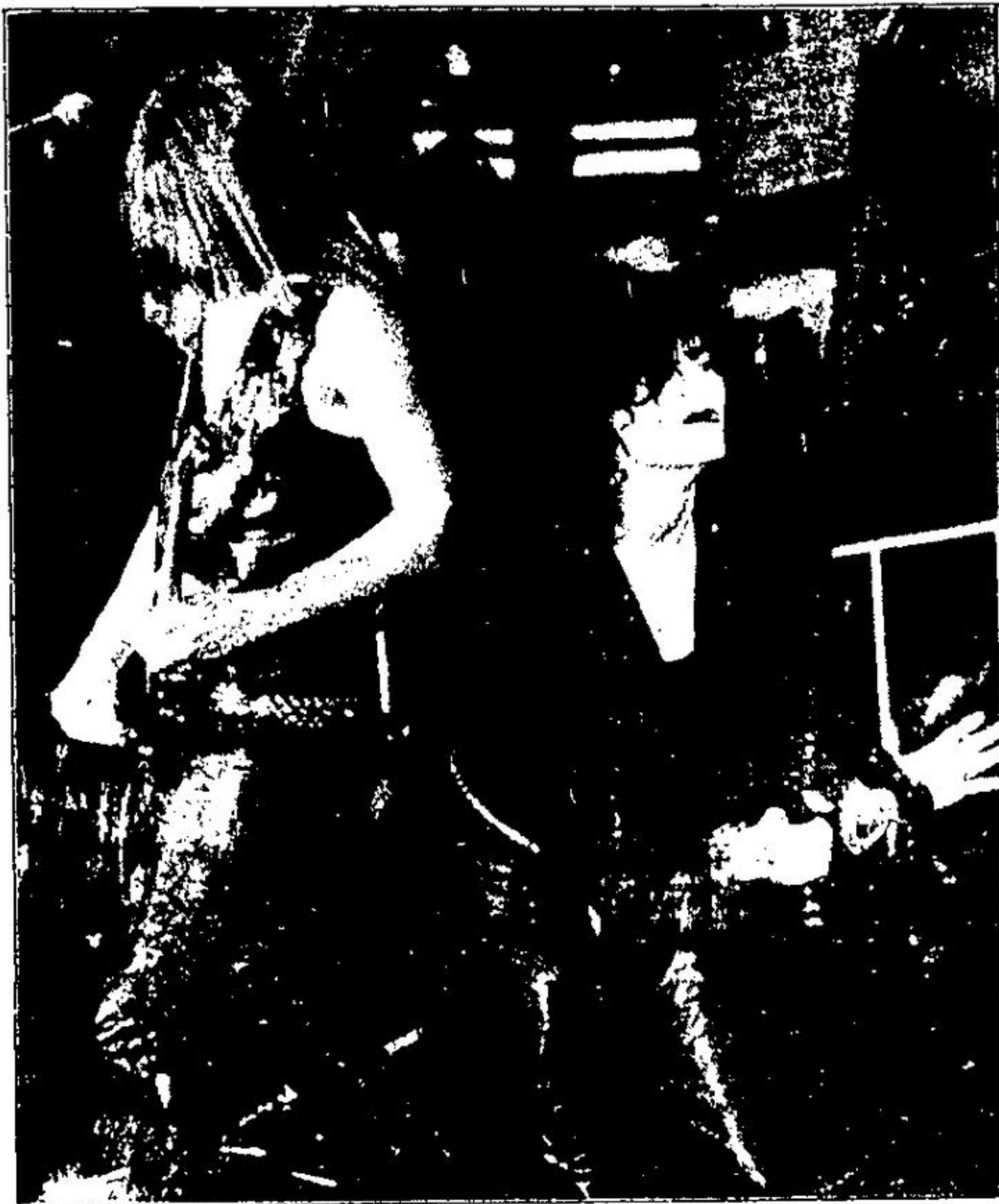
Alannah Myles rocked the audience at Club 2000 Thursday, sharing the rhythm of some of her chart-topping singles. The group stopped in Norval as part of their North American tour.