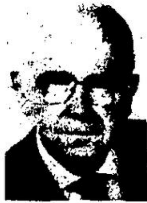
Vince Egan Travel