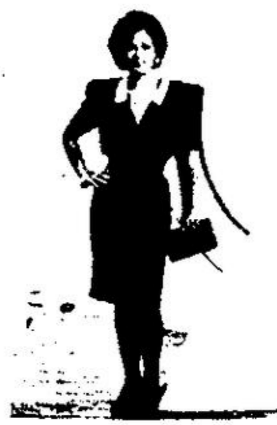
SUE AFTER NUTRI/SYSTEM

Mrs. Sue Hoden goes from size 20 to size 5