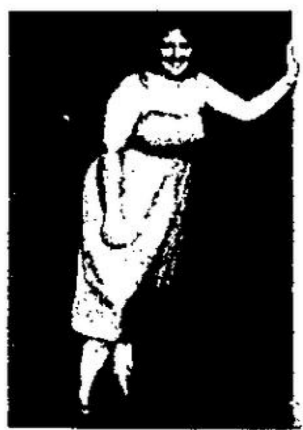
SUE BEFORE NUTRI/SYSTEM

It's a sound, comprehensive program based on common sense and the most advanced nutritional knowledge. It is a professionally supervised