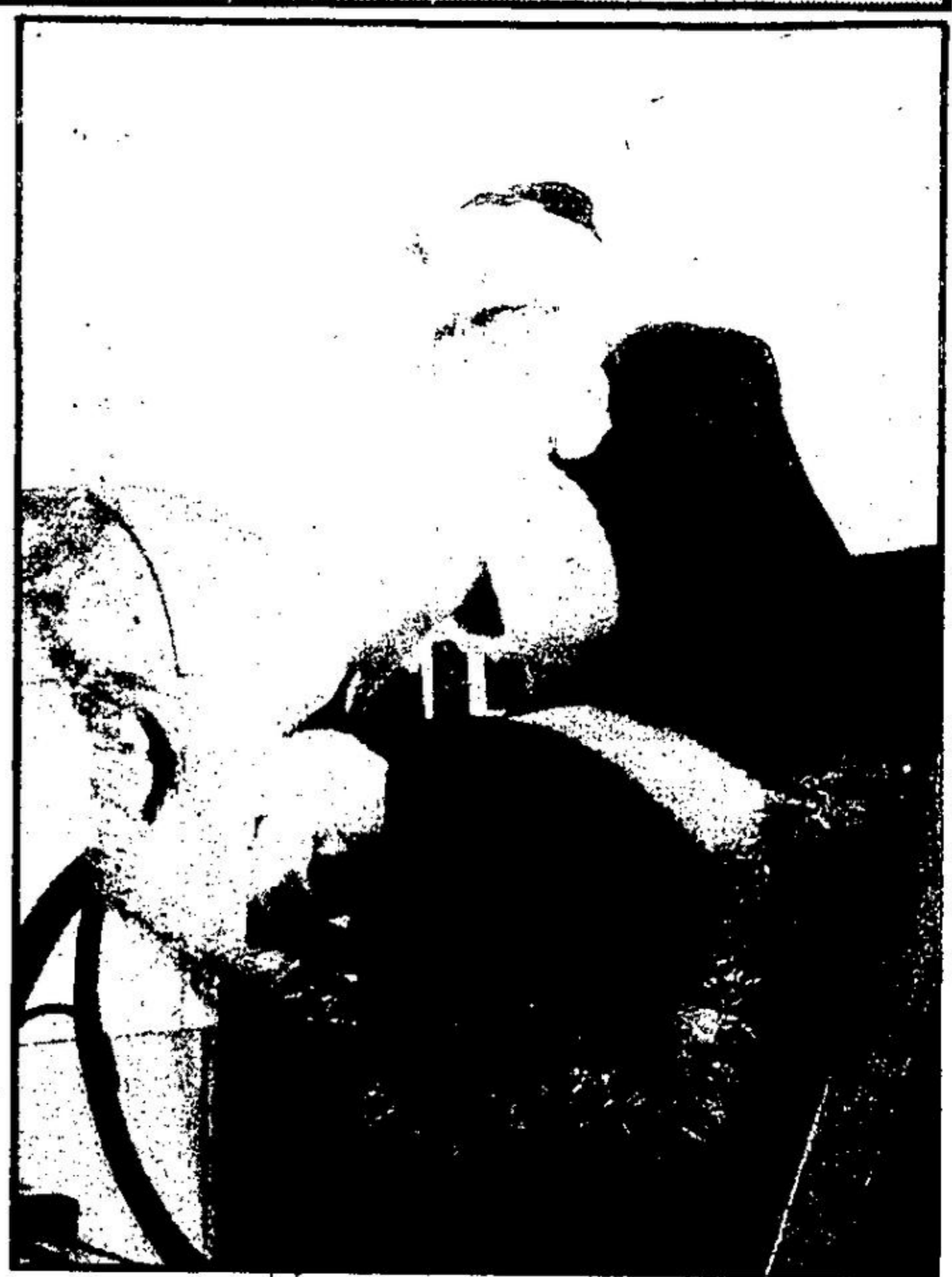
It was safe to say Santa Claus and his reindeer didn't lose their way while making the journey from Acton to Georgetown last week.