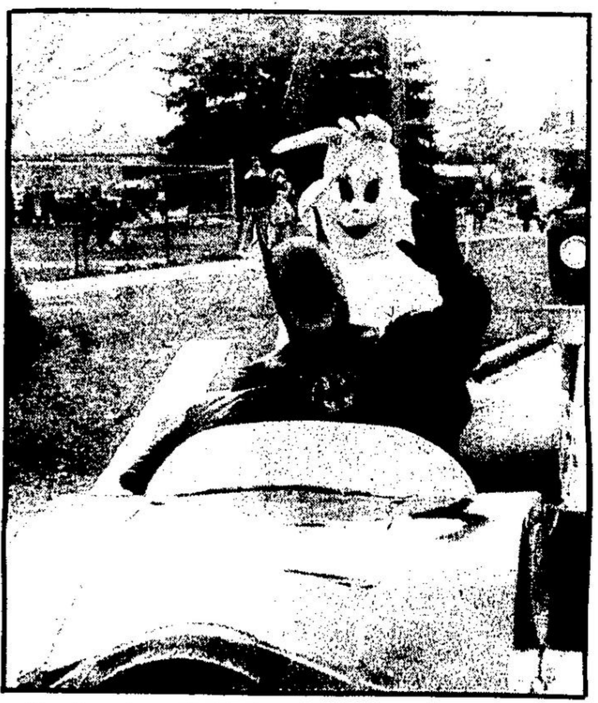
The Georgetown Fireflies' camping club featured the caped crusader who took a break from fighting crime and starring in his own movie to ride in this year's Santa Claus parade.