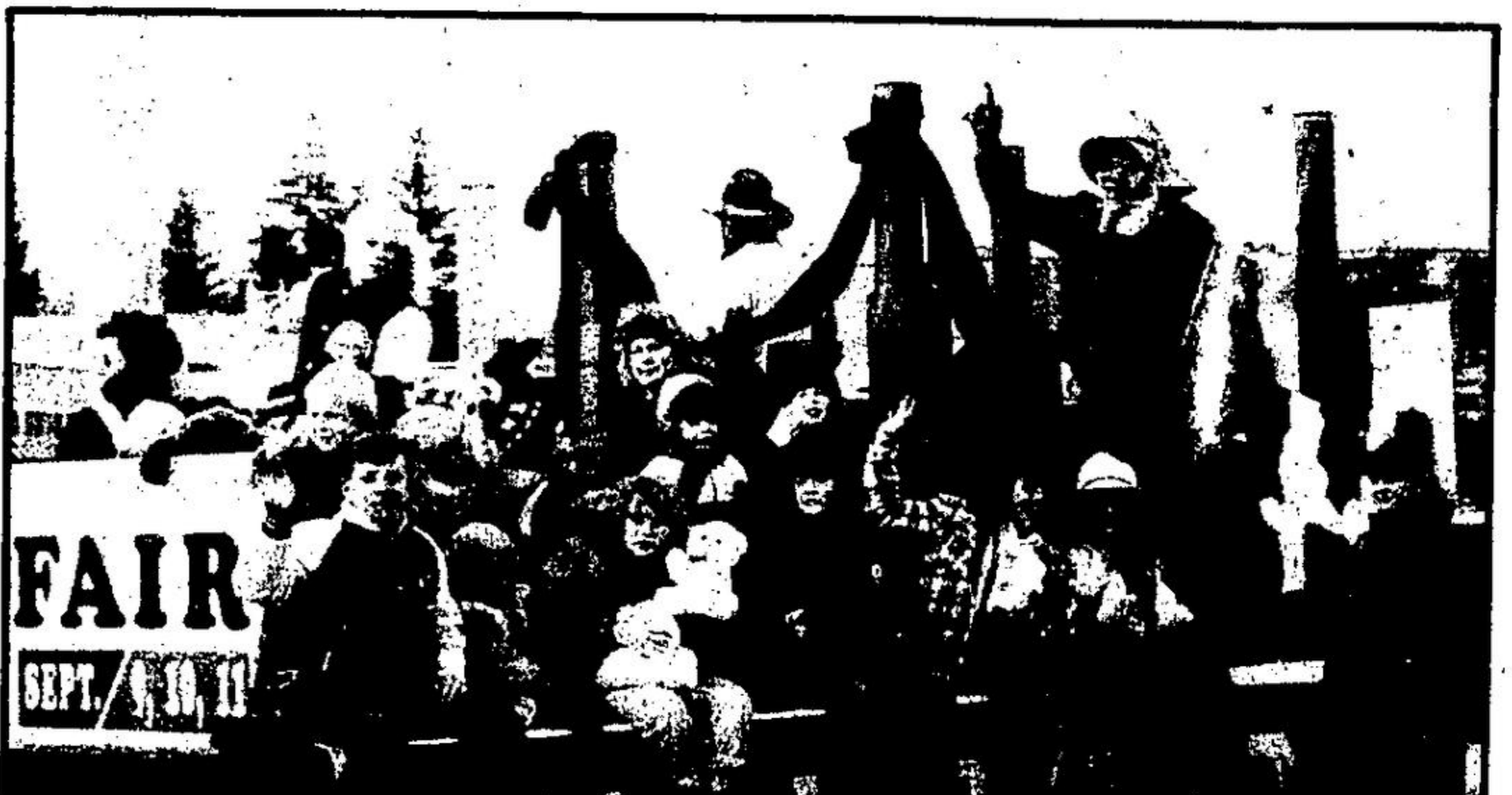
The Georgetown Fair float shows that even pigs can get into the Christmas spirit.