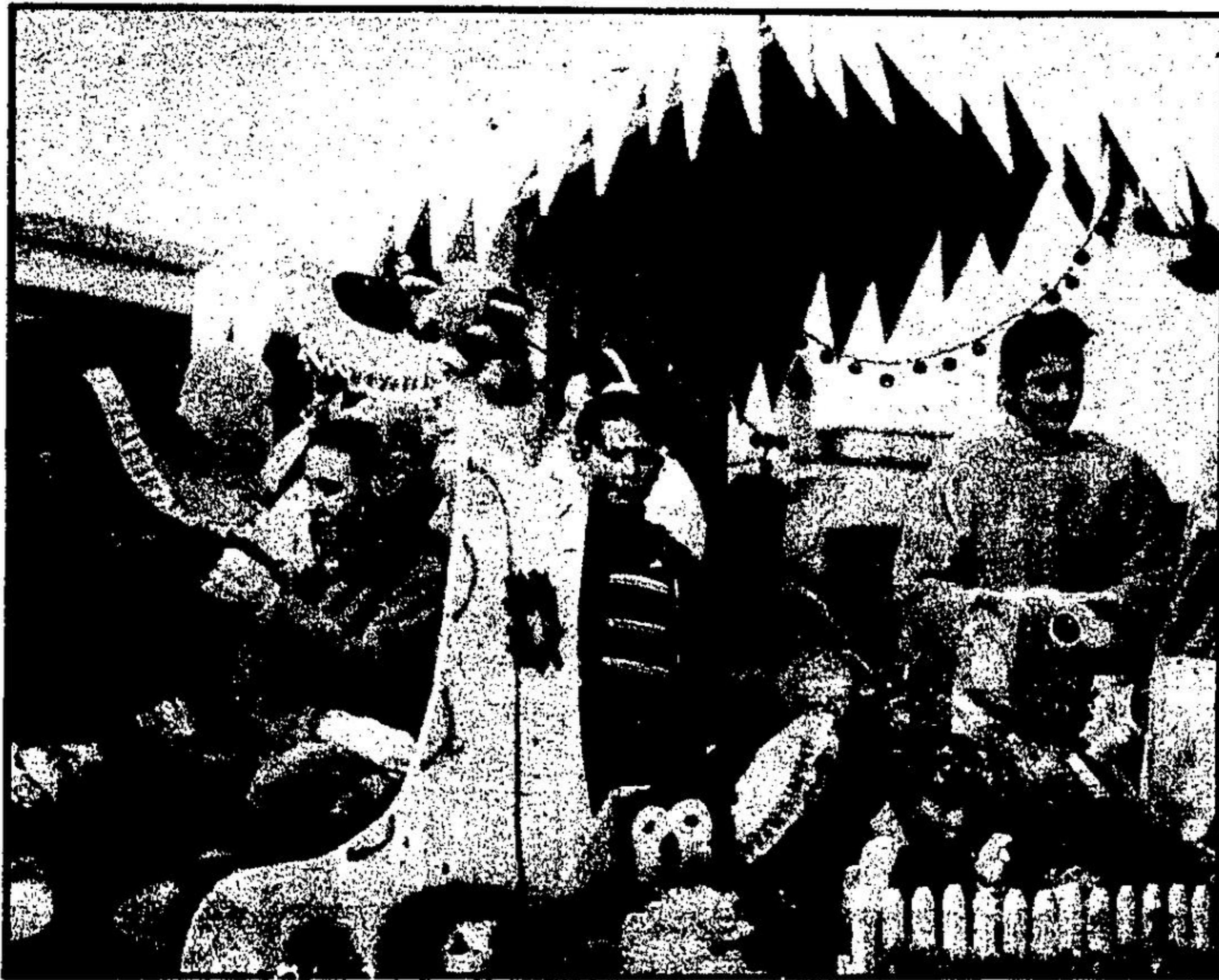
Although there was no snow on the ground, the parade was still blessed with a winter wonderland.