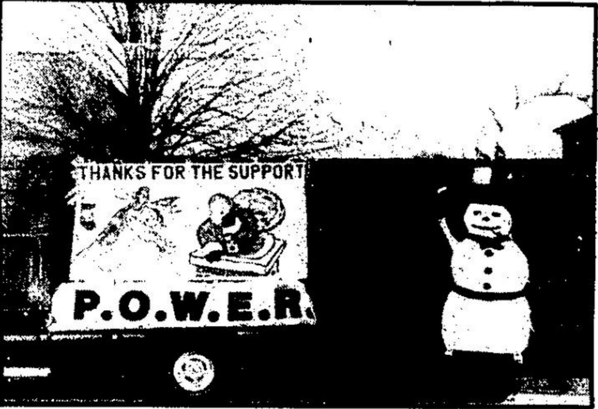
POWER's controversial float showed that Christmas is about giving.