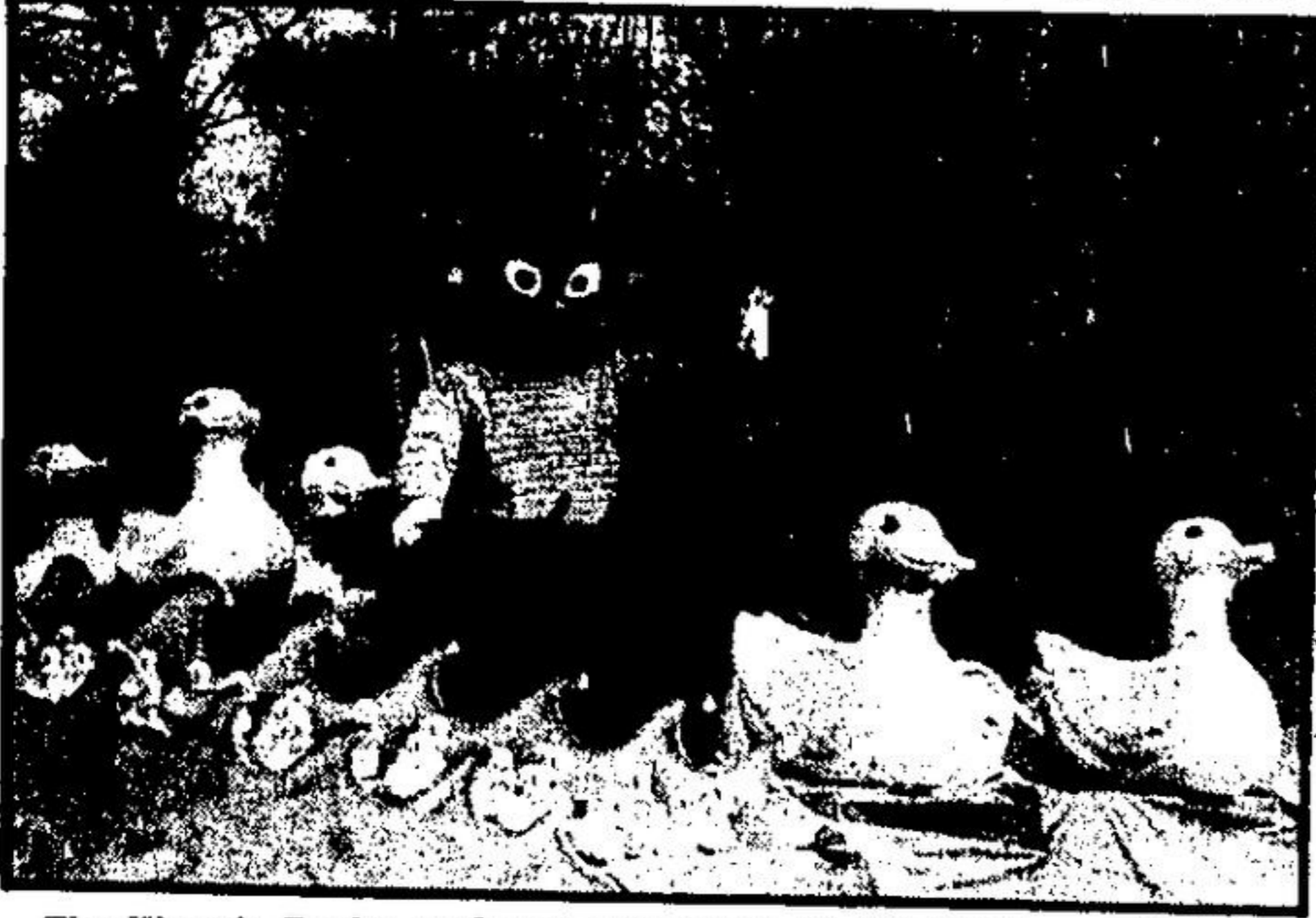
The Kiwanis Ducks made an appearance at this year's parade but they were in no way a fish out of water.