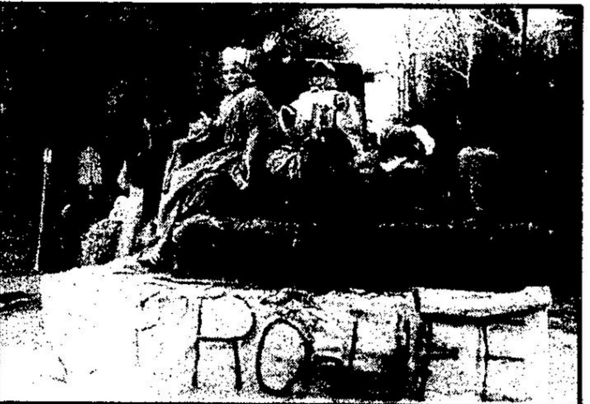
This controversial pro-life float highlighted the spiritual side of Christmas.