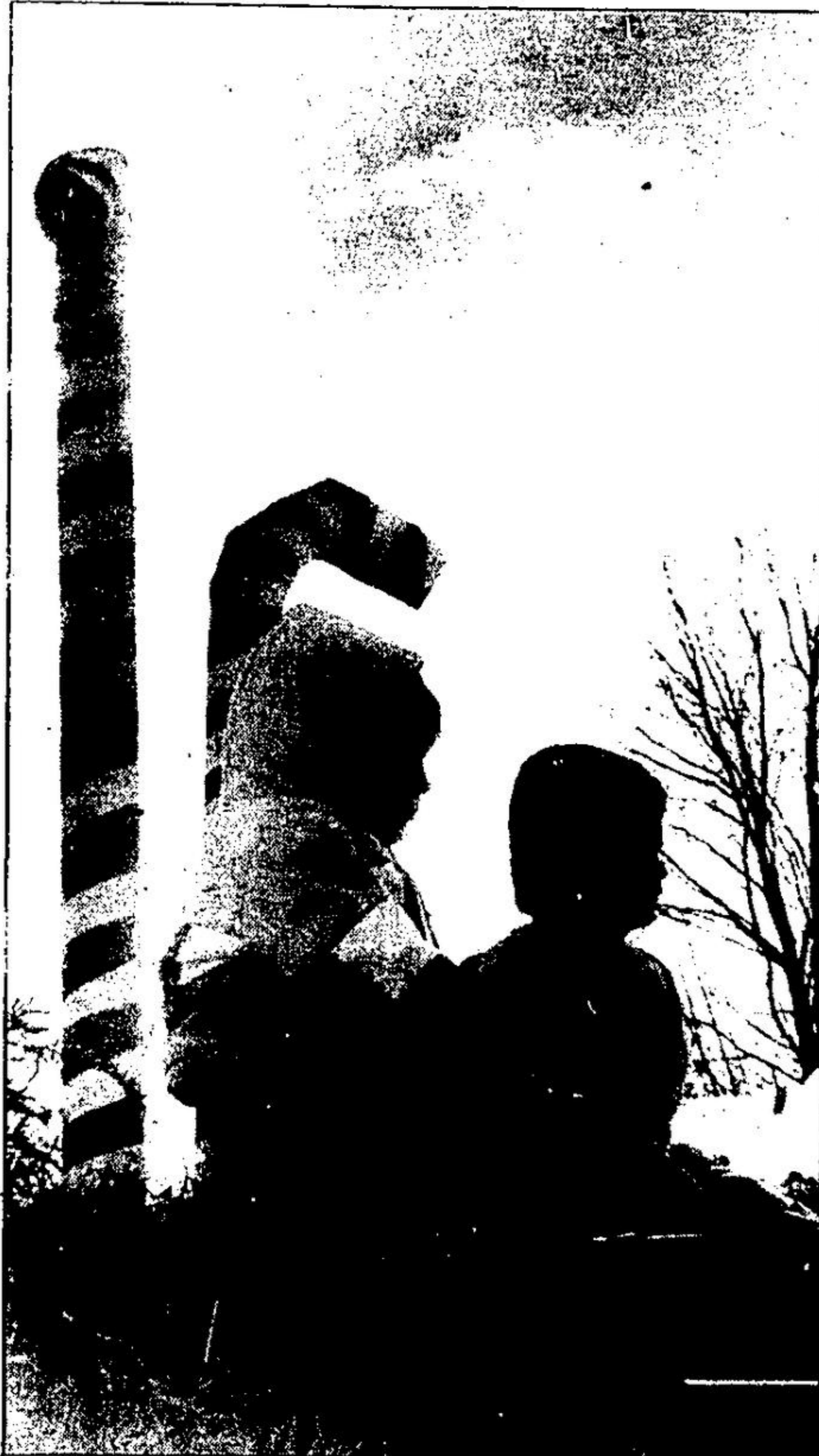
Christmas is also solemn time. These two youngsters seem to feel the spirit of peace as they rest on hay stacks on the float parading through Acton Saturday. Brisk temperatures and falling snow made Christmas seem just around the corner.