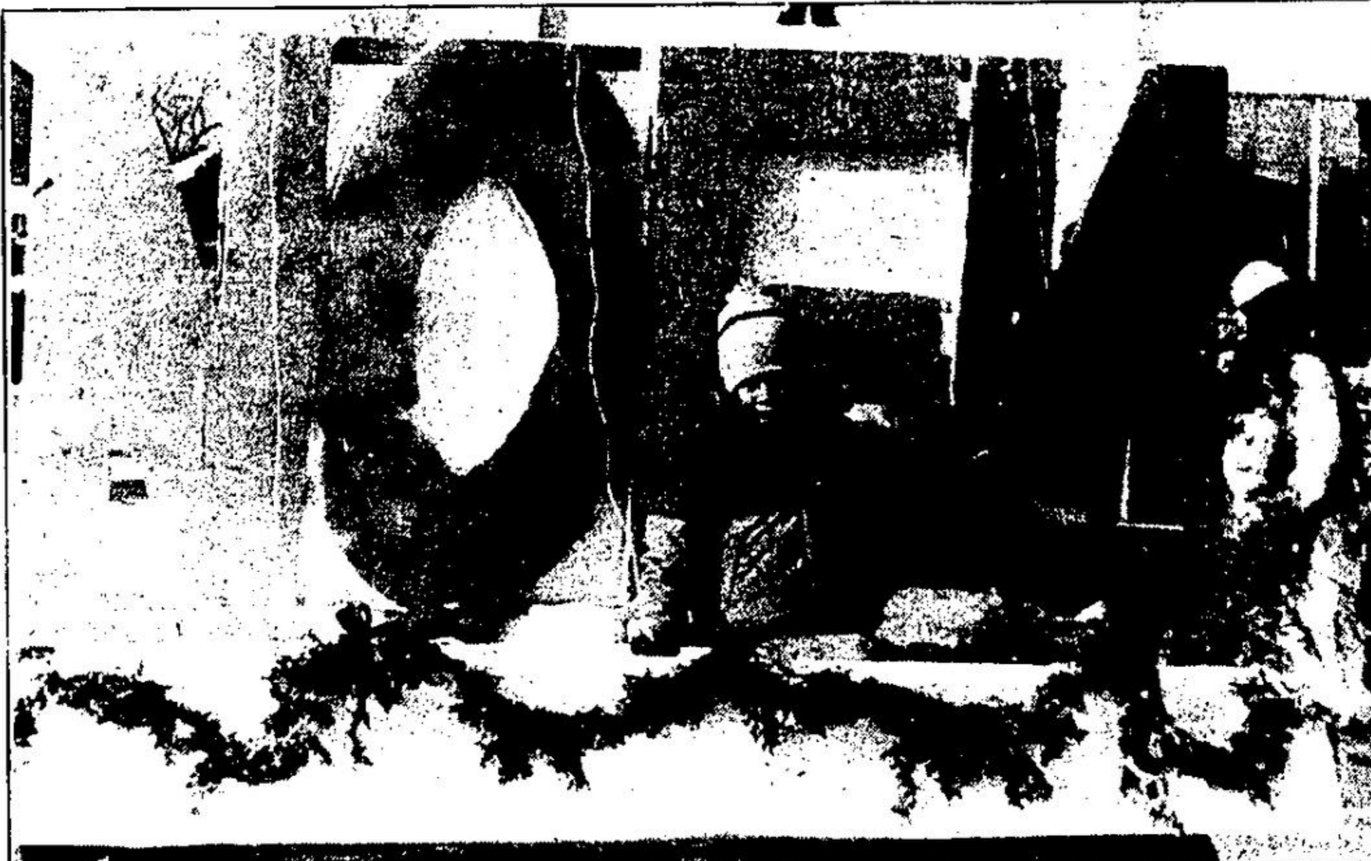
Even in French, it means Christmas. This boy was bundled up for a chilly Saturday as he sat atop one of the floats parading through Acton. Parade watchers were given a hint of Christmas with falling snow and falling temperatures.