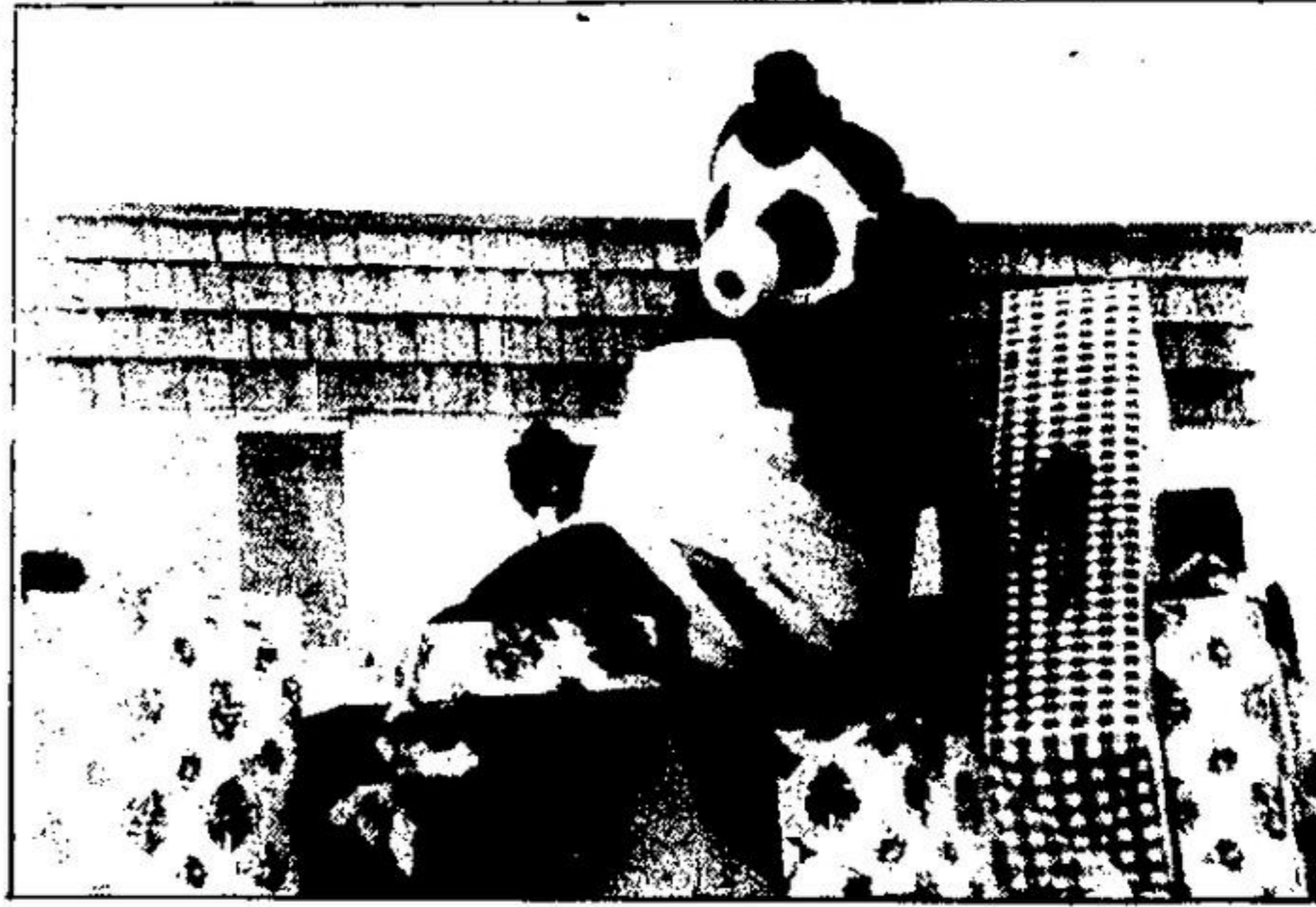
Hey, weren't you at the Metro Zoo a few years ago? All the way from China, straight to Acton, this friendly Panda bear looked cuddly atop Christmas gifts piled high on this float.