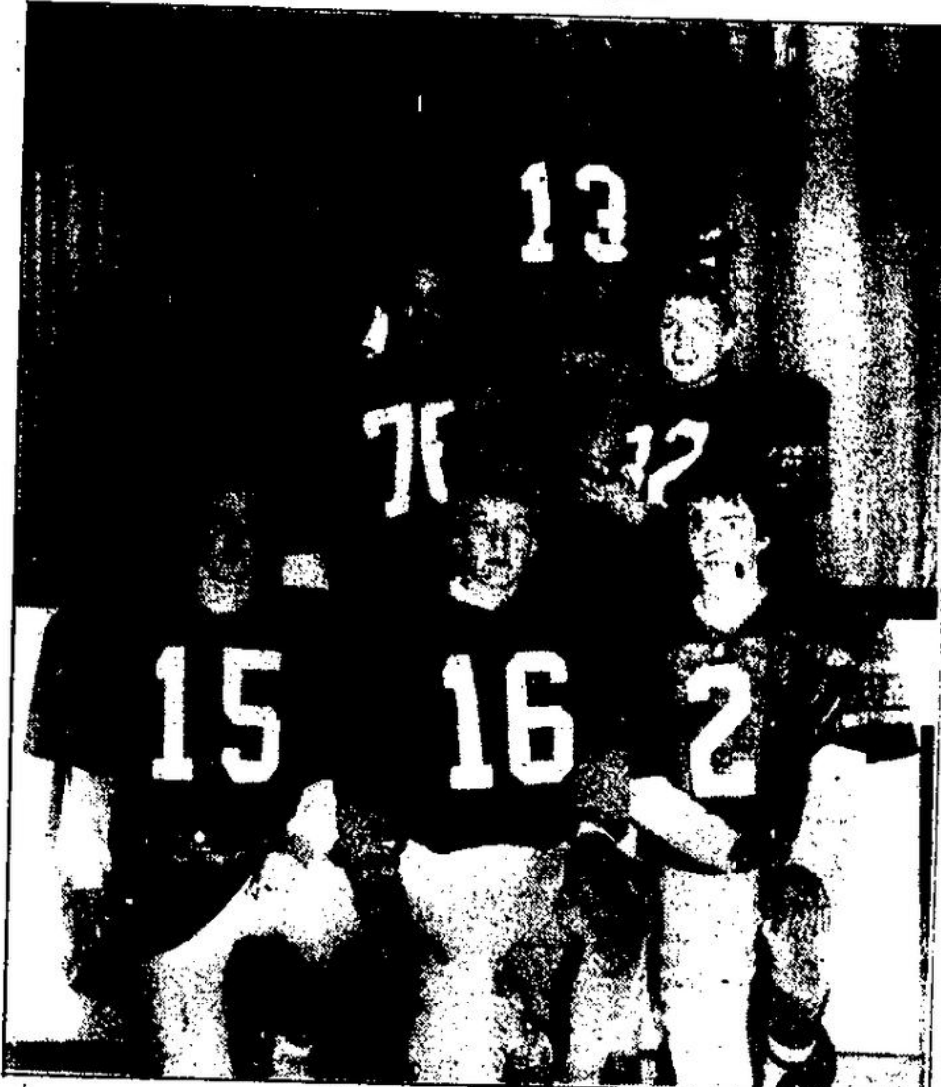
Over the top