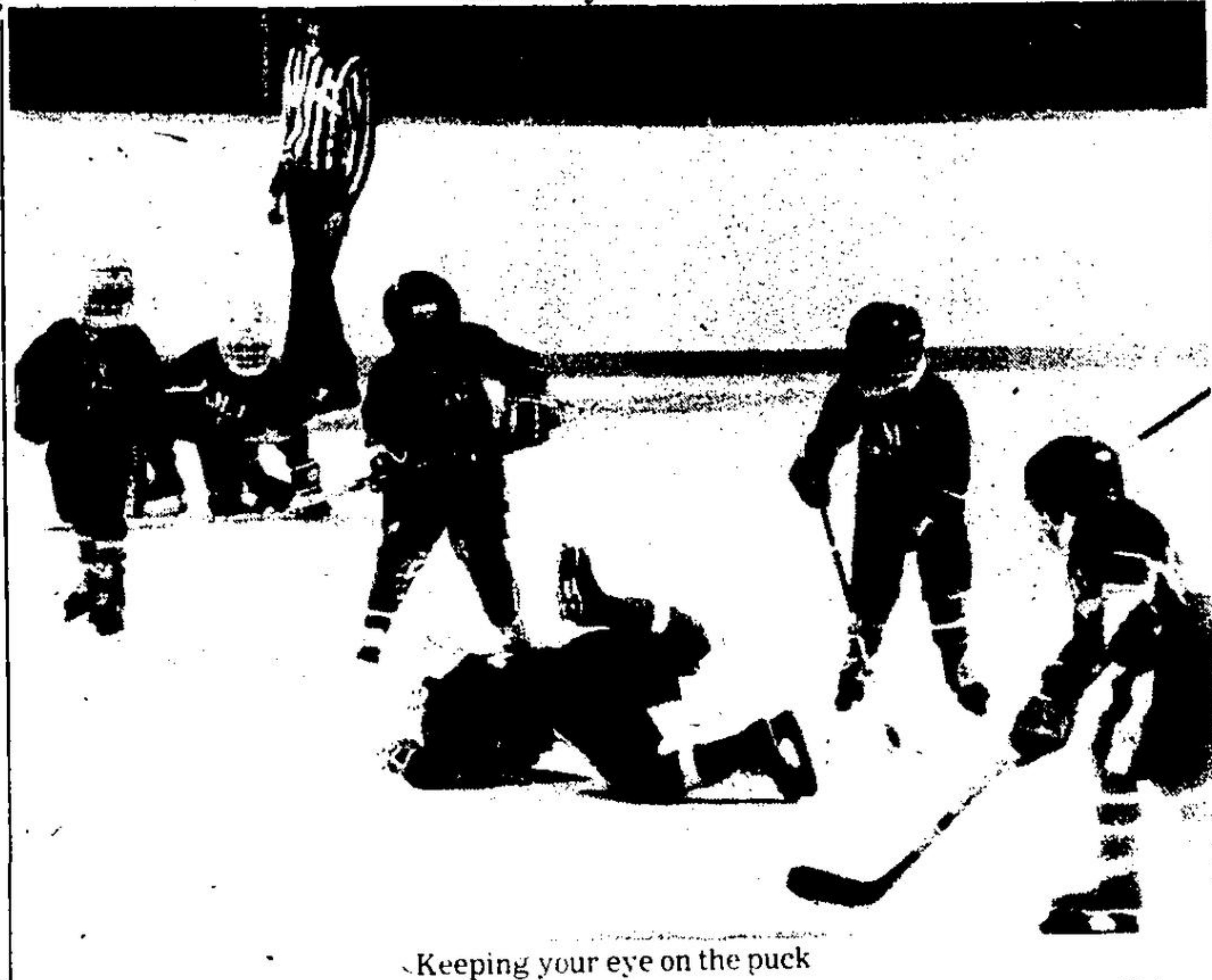
Keeping your eye on the puck