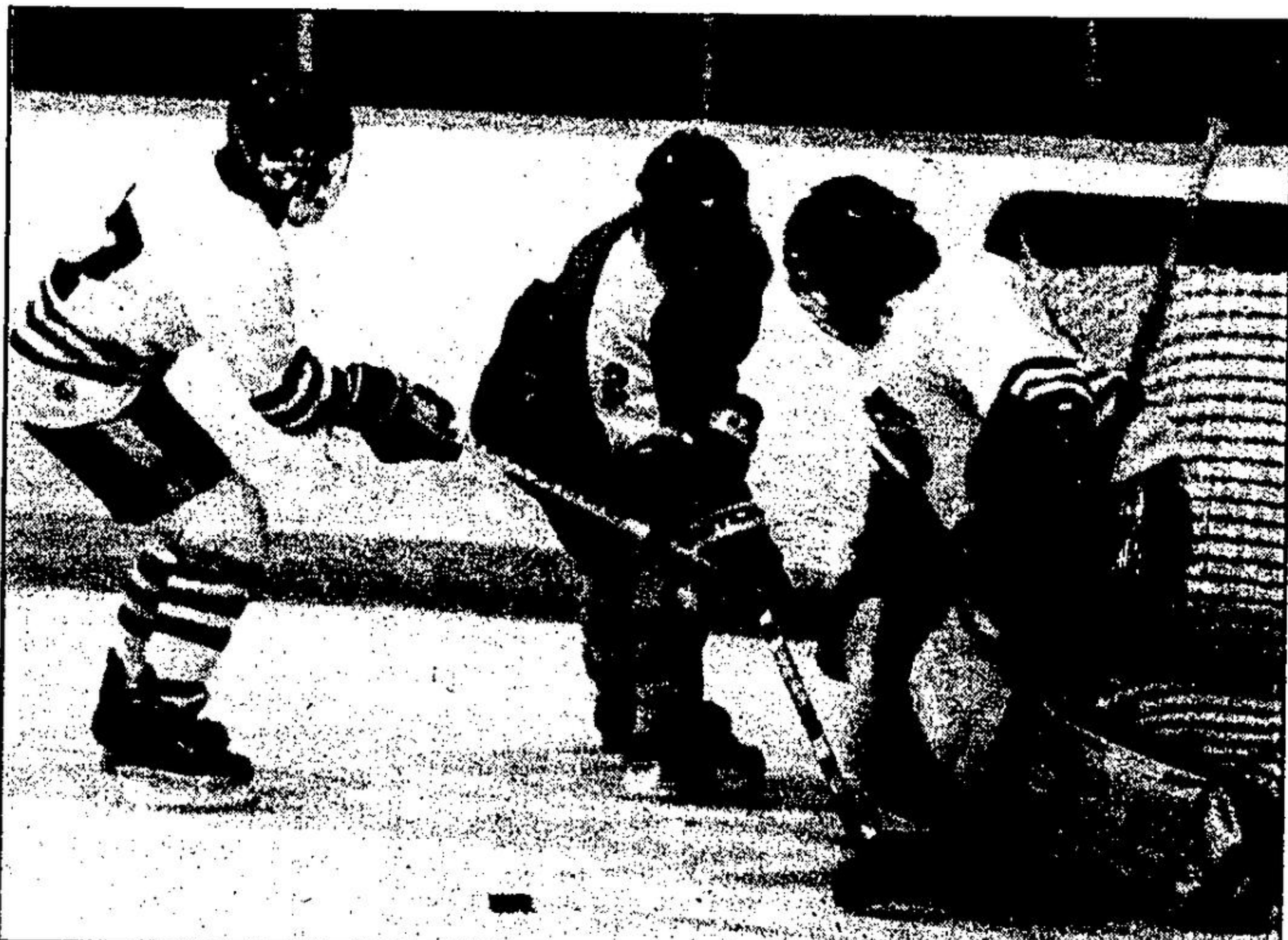
TOTAL TEAM EFFORT has paid huge dividends for Georgetown Sunny Acres Farms midget hockey team in the early going of their 1989-90 Tri-County Hockey League season. Sunny Acres boasts a 5-0-1