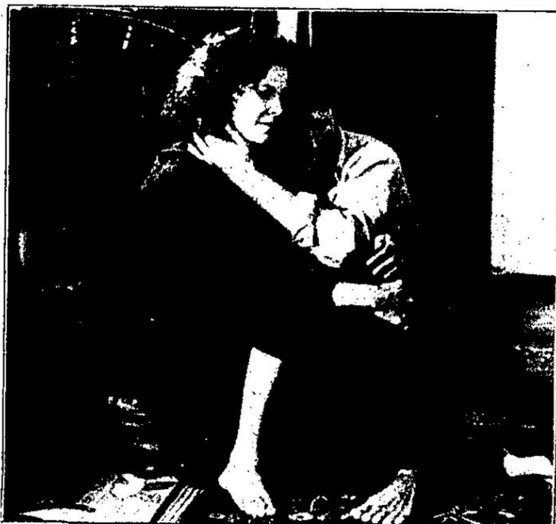
SARAH'S (JoBeth Williams) life is thrown into turmoil when the husband she thought had been killed in Vietnam (Kris Kristofferson) turns out to be alive in "Welcome Home."

by Sonny Crowkiller (Billy Wirth), a descendant of the chief in the original skirmish. Convinced that "nothing's changed in a hundred years," and that they will be blamed for the violence, Sonny and his buddies go on the lam. And so does the movie, as it turns