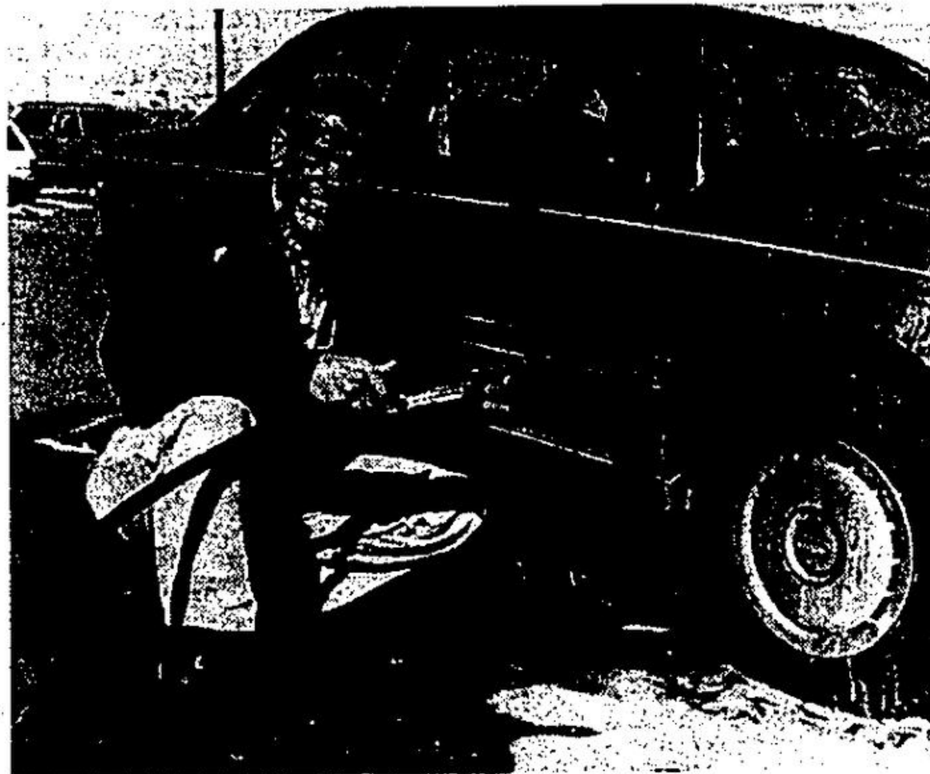
ACCORDING TO CHAMPION RACE CAR DRIVER, Bobby Unser, the best way to prevent rust is by keeping your car clean. Turbo-Wash® pressure washer eliminates dirt without scrubbing, protecting your car's finish from the "demons of winter."

money. Instead of protecting your car, the cover traps moisture and slows down evaporation.