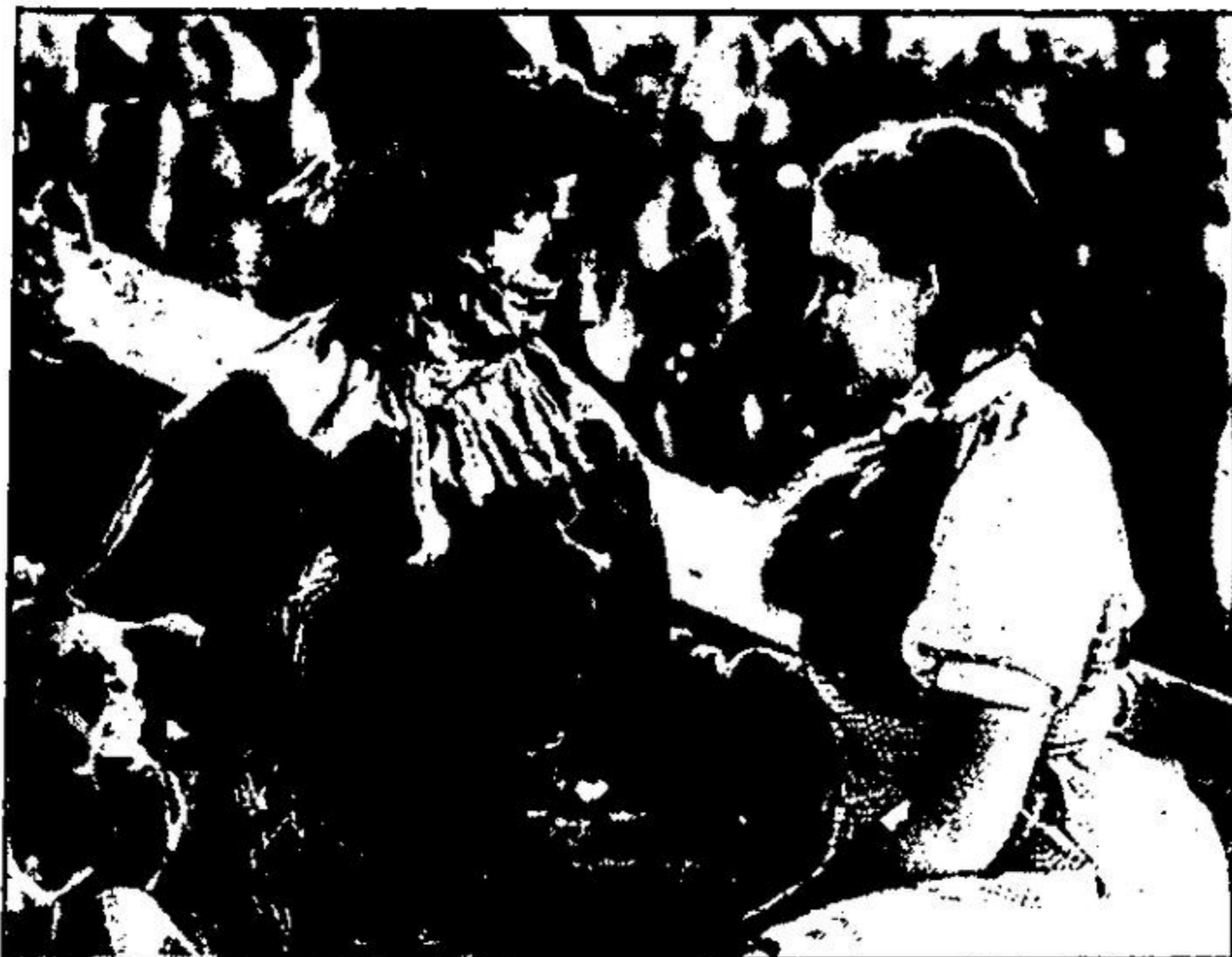
HONOR "The Wizard of Oz" on the movie's 50th anniversary and go to your costume party dressed as Dorothy or the Scarecrow. If you have children, they can go along as Munchkins.

Blame it on the full moon or the fantasy, but Halloween has a romantic edge. I've always liked partner costumes. One of the most charming couples I know went to a party as the