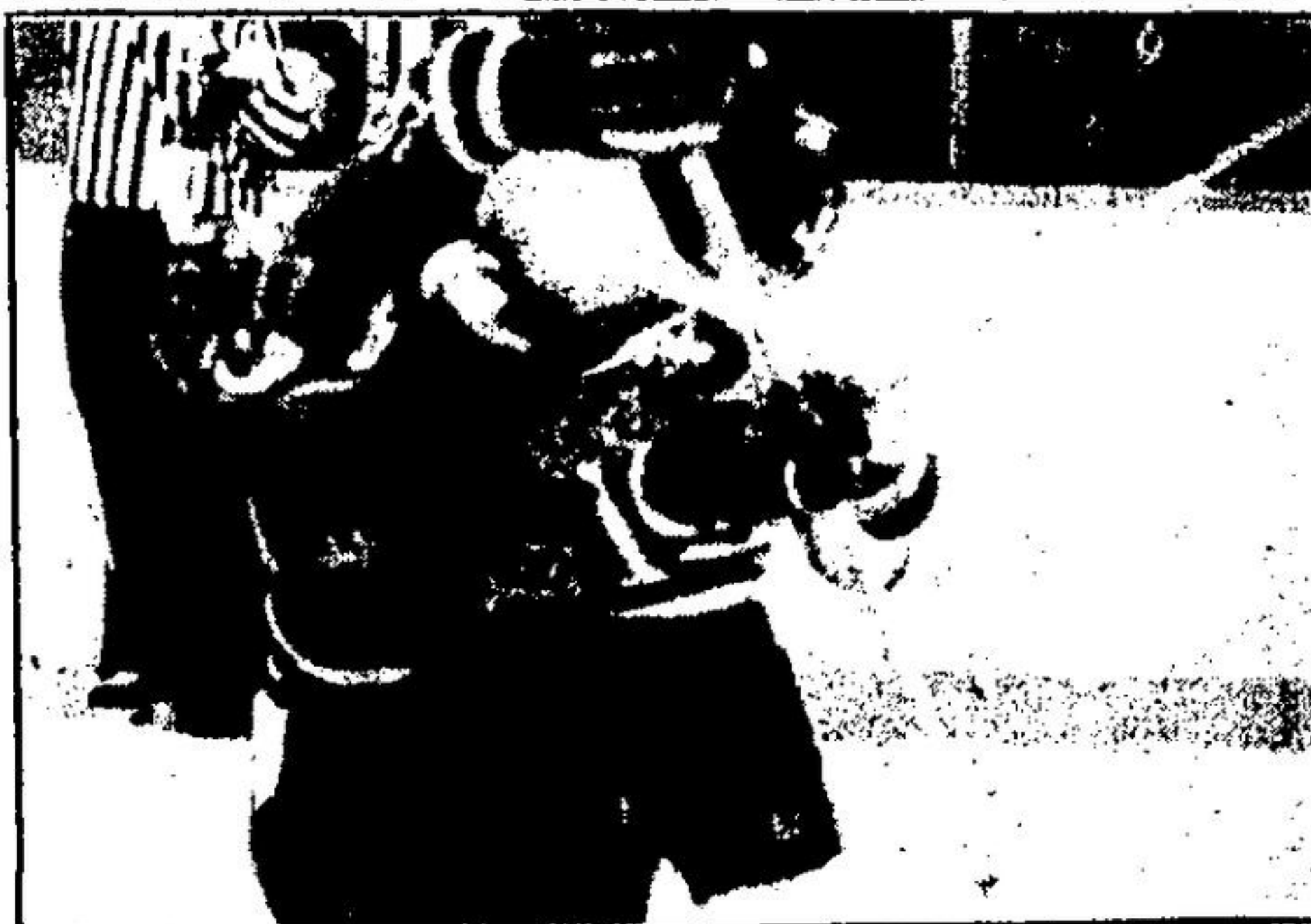
NO QUARTER WAS ASKED, or given, in the Raiders-Milton Merchants game Saturday night at Gordon Alcott Memorial Arena. Raiders defeated Milton twice in pre-season exhibition games, but the Merchants came out on top 6-3, in the Saturday regular season contest.