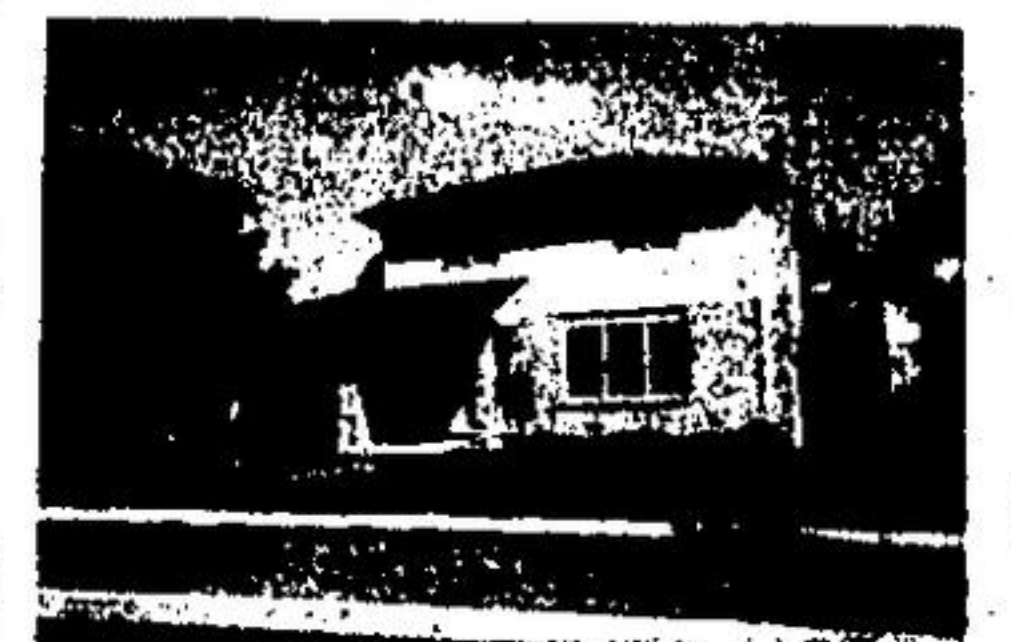
NOW ONLY $229,900.

Popular Sinclair model, 3 bedroom home - often requested but seldom on the market. Lovely main floor family with brick fireplace, sunshine ceiling in the greenhouse kitchen, beautiful master with ensuite and oversized walk-in closet. Priced to sell at $244,900. Call Glenda Hughes for your personal tour. NRS-9208