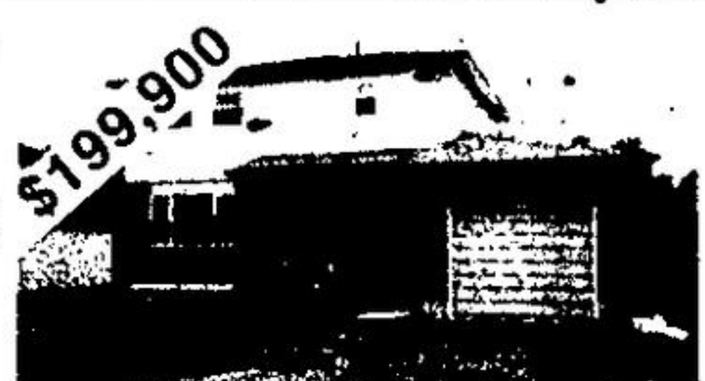
COMMUTERS TAKE NOTE:

This Cape Cod home features a gourmet kitchen with built-in appliances - a dream to prepare meals. The finished lower level has a walkout, plus 2 walkouts from the main level to a large deck that overlooks miles and miles. See the view with John Hill. Prices at $299,900. NRS-9187