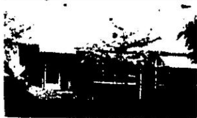
FIRST TIME BUYERS TAKE NOTE!

Immaculate 4 bedroom home, ready for you to move in! Main floor family room, main floor laundry, large eat-in kitchen, freshly decorated and on a 1/2 acre lot just minutes from town. All for $279,900. Call John Hill. NRS-9177