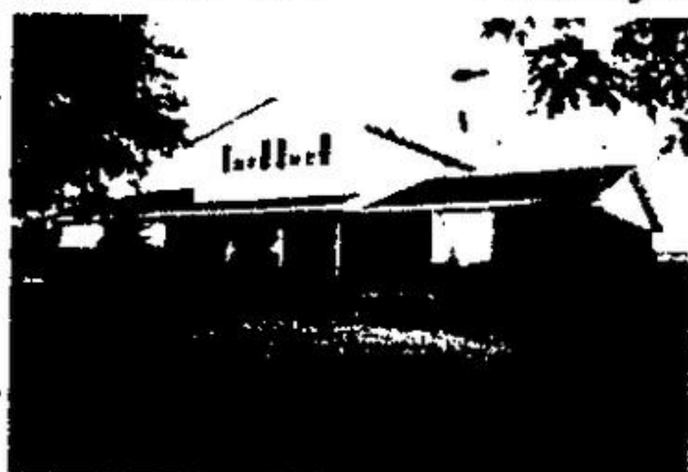
OUTSKIRTS OF ERIN

Mint condition, fully restored Victorian beauty, situated on an in-town 1/2 acre treed lot. Charm and elegance abound with huge separate dining room with fireplace, country kitchen, hammered tin ceilings, original moldings and French doors. Features include: main floor library, family room, walk-in pantry, games room, office and separate nanny's quarters or apartment. Call Glenda Hughes anytime. NRS-9064