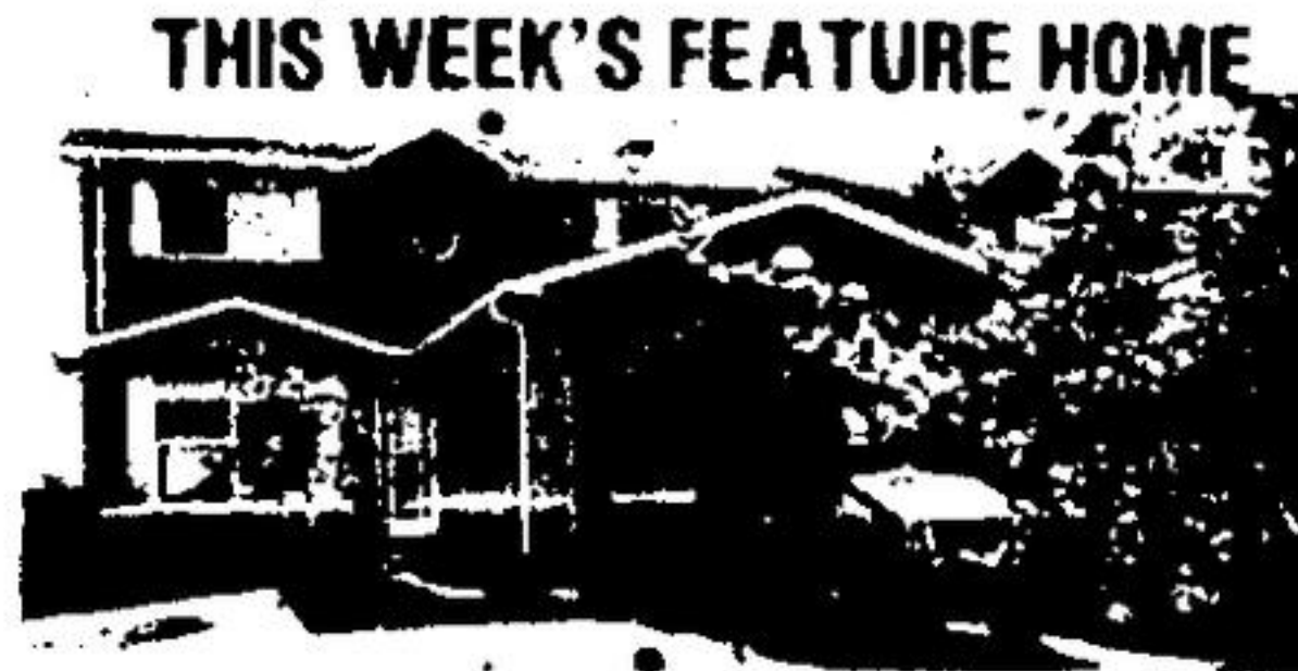
NEW LISTING - BOLTON

It's a lovely home, located on a most beautiful lot. Clean as a whistle, nicely decorated and maintenance free. Finished from top to bottom. It's a home for the family to enjoy. View it personally with Glenda Hughes. Realistically priced at $184,900. NRS-9189