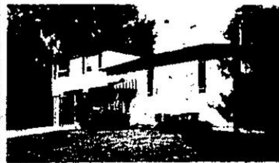
QUIET COURT LOCATION

This Wildwood Road home stops the traffic. Beautiful brick work and pretty landscaping greet the eye as you walk up the driveway. Inside this custom home are four spacious bedrooms, separate living room and dining room, main floor family room, and fireplace and 3 baths. Come, see this executive home with Glenda Hughes. NRS-9144