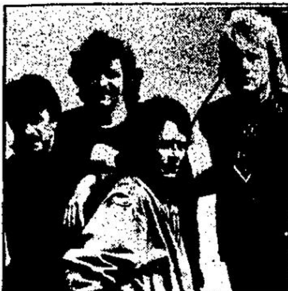
Ten Years After

called the guys up and asked them if they wanted to do it. We rehearsed for two days and then did the gigs. There were 30,000 people at each show, with banners outside reading 'Welcome Back, Ten Years After.' It was too good to let go."