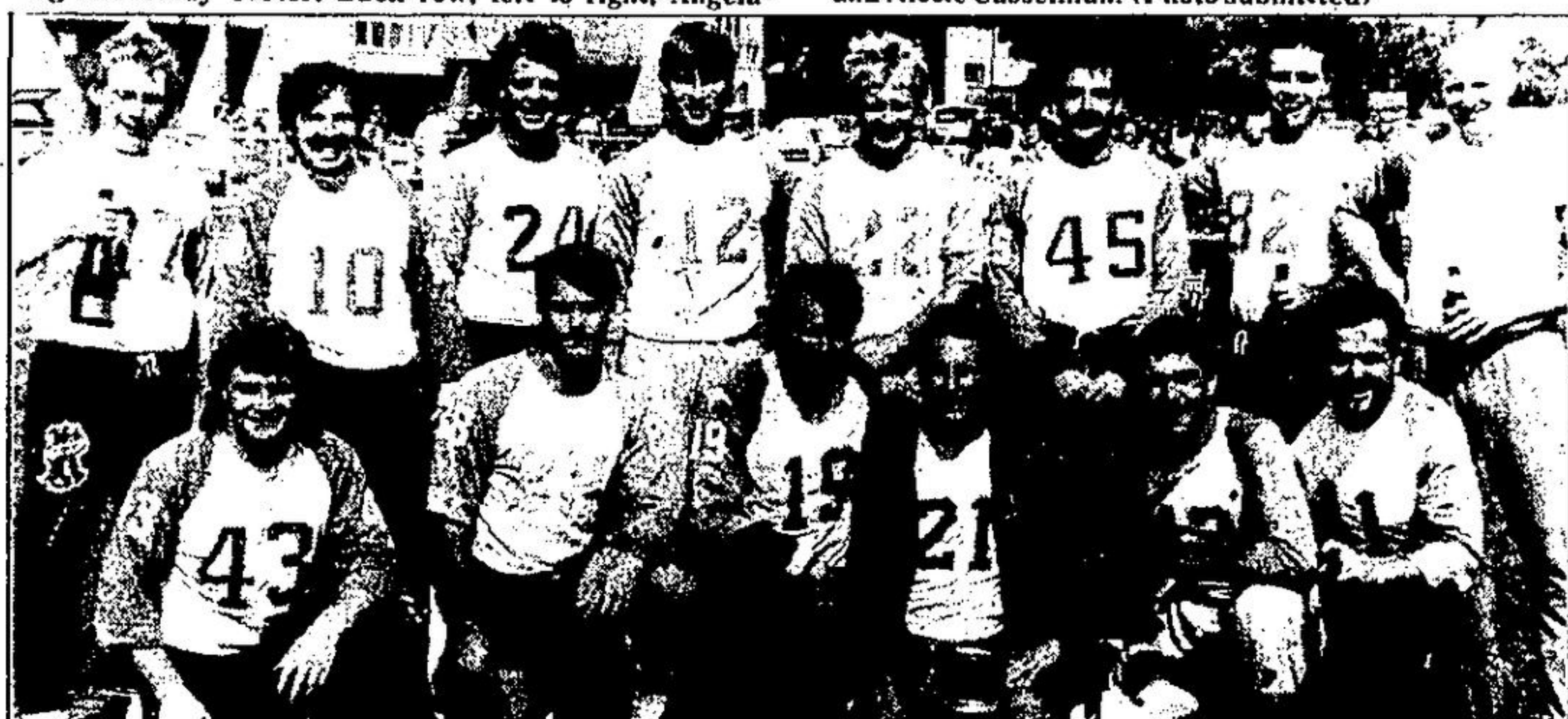
Flag Football Champions