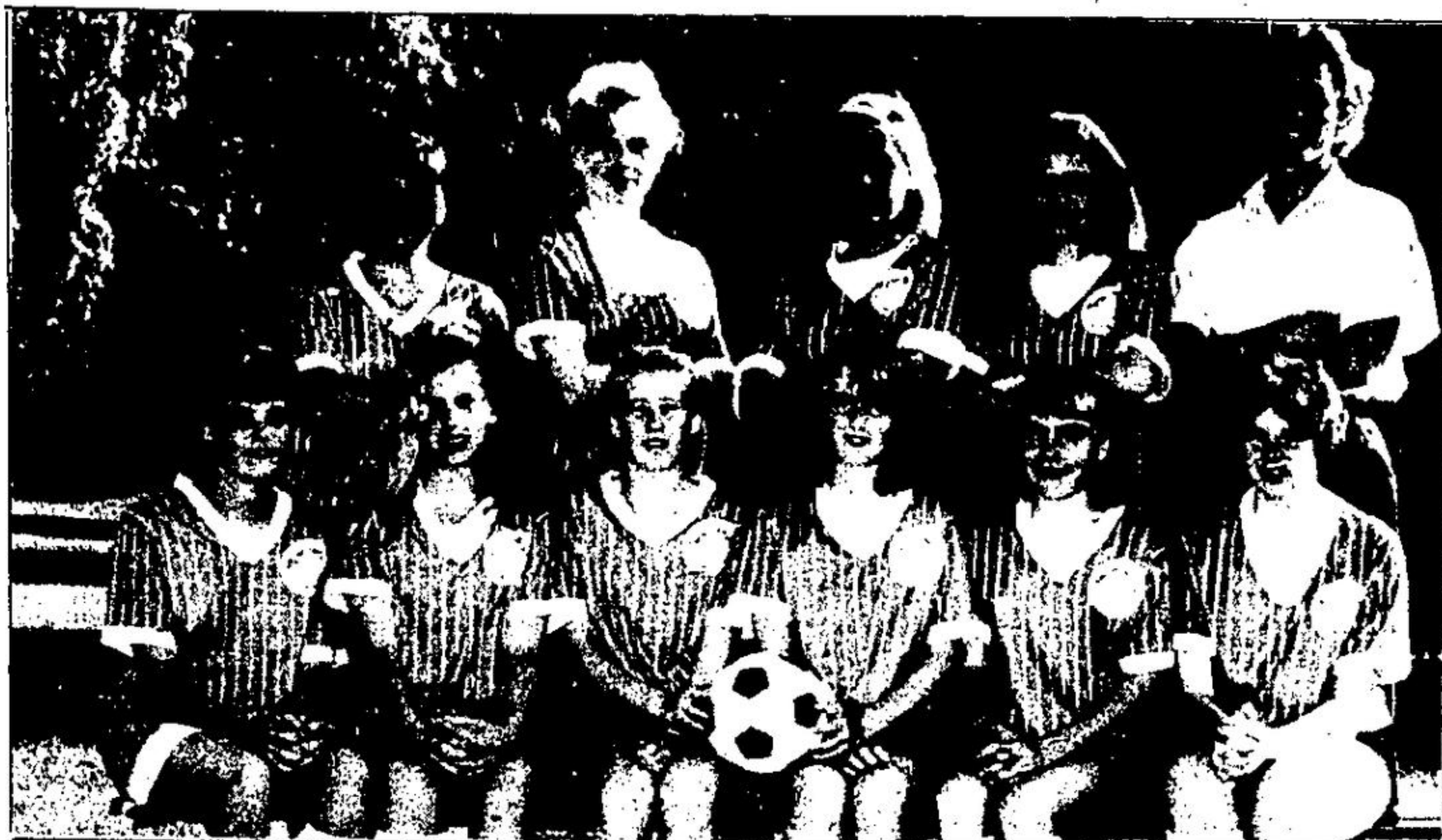
1989 Cup Finalists