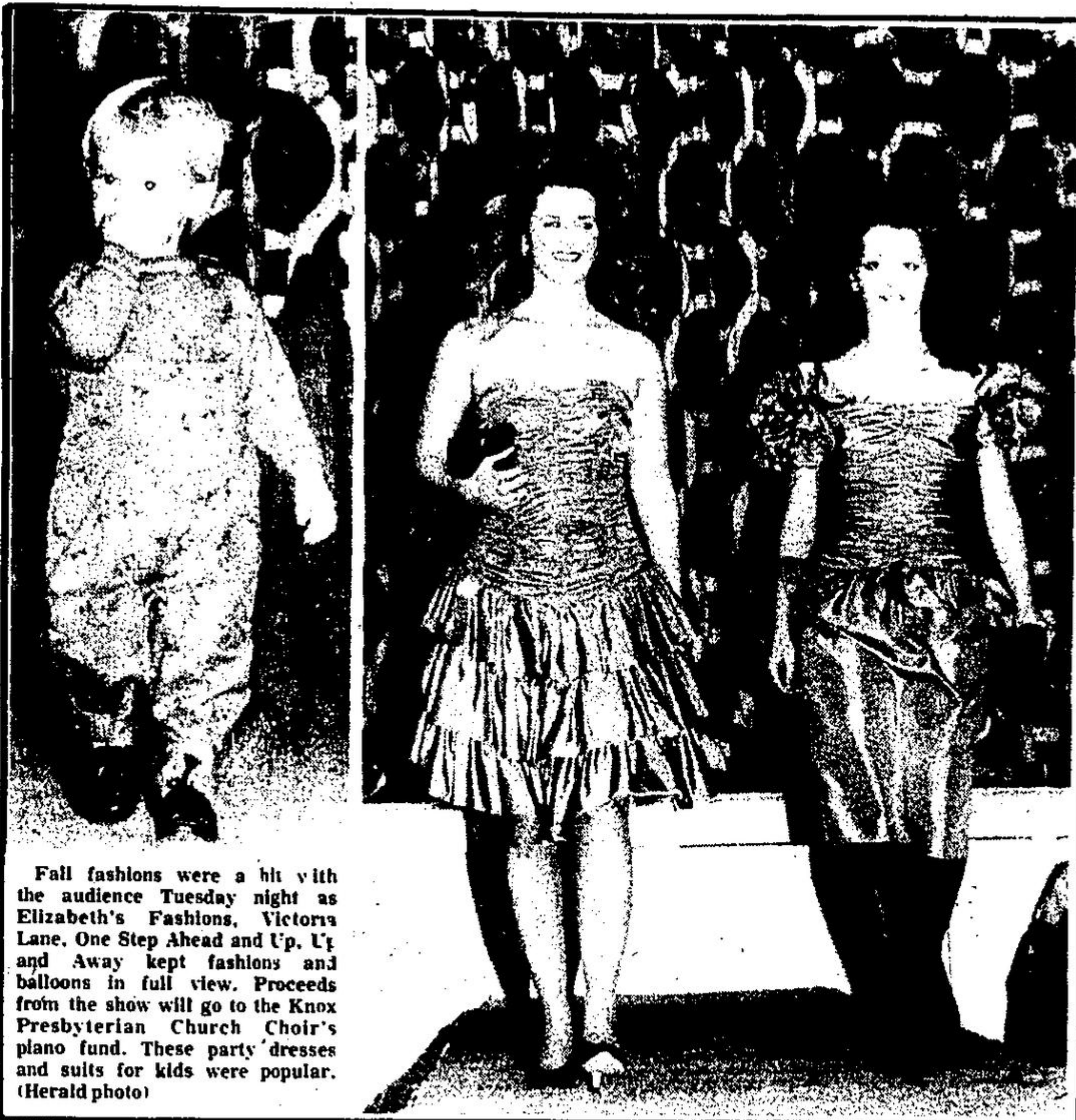
Fall fashions were a hit with the audience Tuesday night as Elizabeth's Fashions, Victoria Lane, One Step Ahead and Up, Up and Away kept fashions and balloons in full view. Proceeds from the show will go to the Knox Presbyterian Church Choir's piano fund. These party dresses and suits for kids were popular.