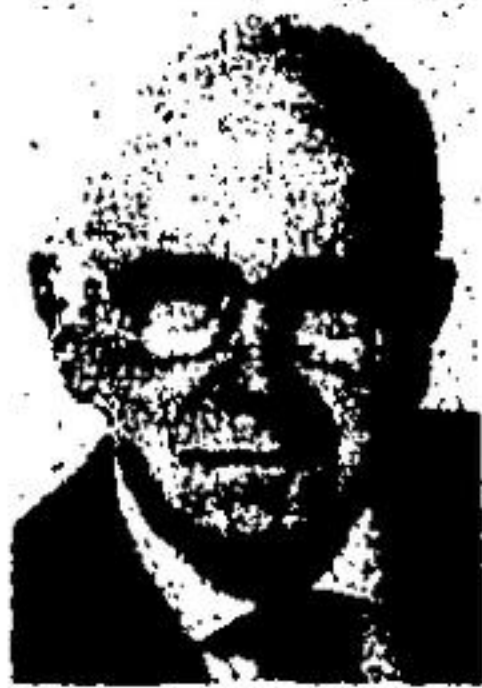
Vince Egan Travel