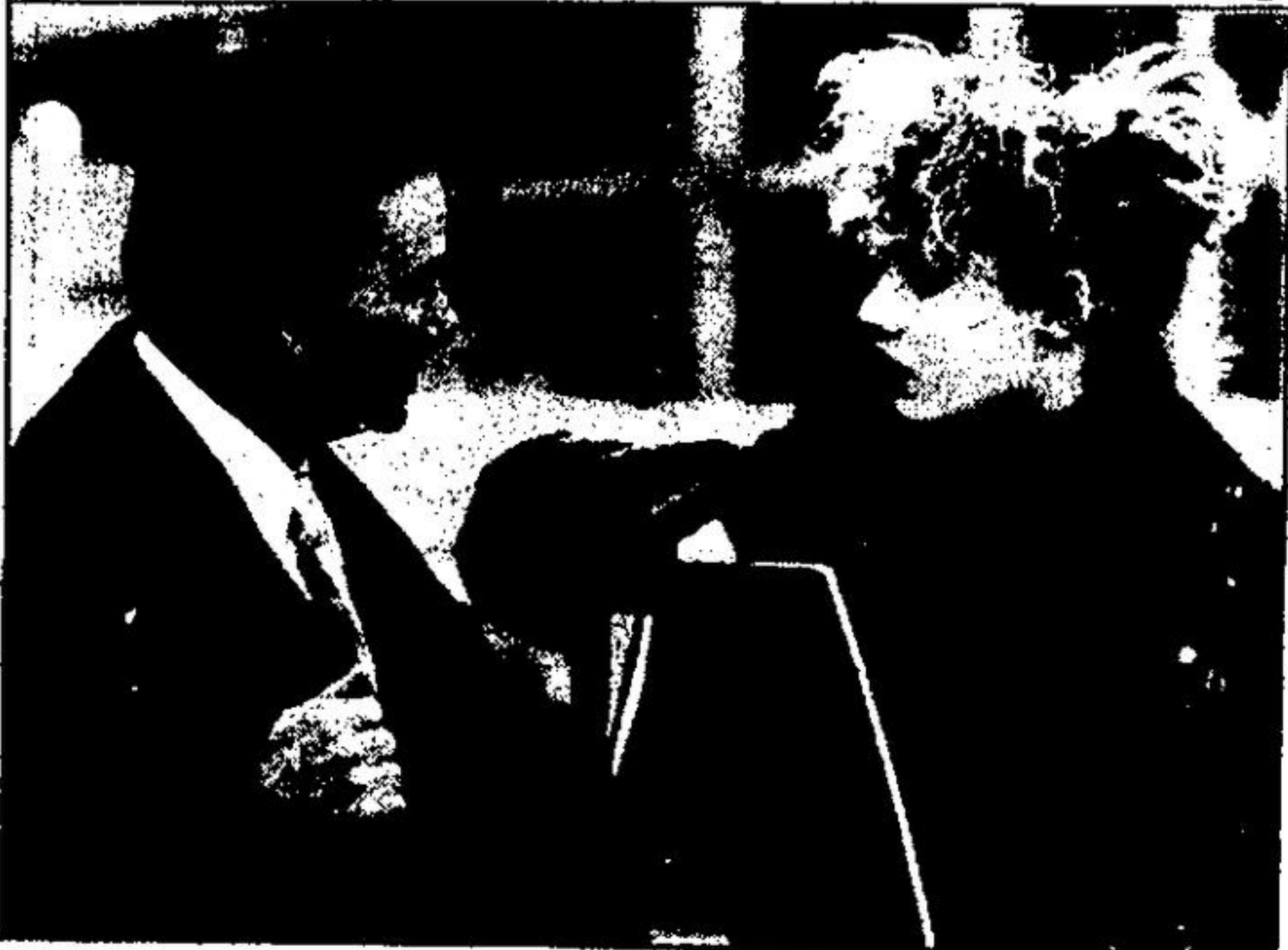
PETER FALK and Emily Lloyd star as a hot-tempered father and daughter who manage to stay one step ahead of both the mob and the law in "Cookie," a new comedy from director Susan Seidelman.

It's amazing that you can think an outfit looks good in the dressing room or bedroom and then hate the way it looks when you go public.