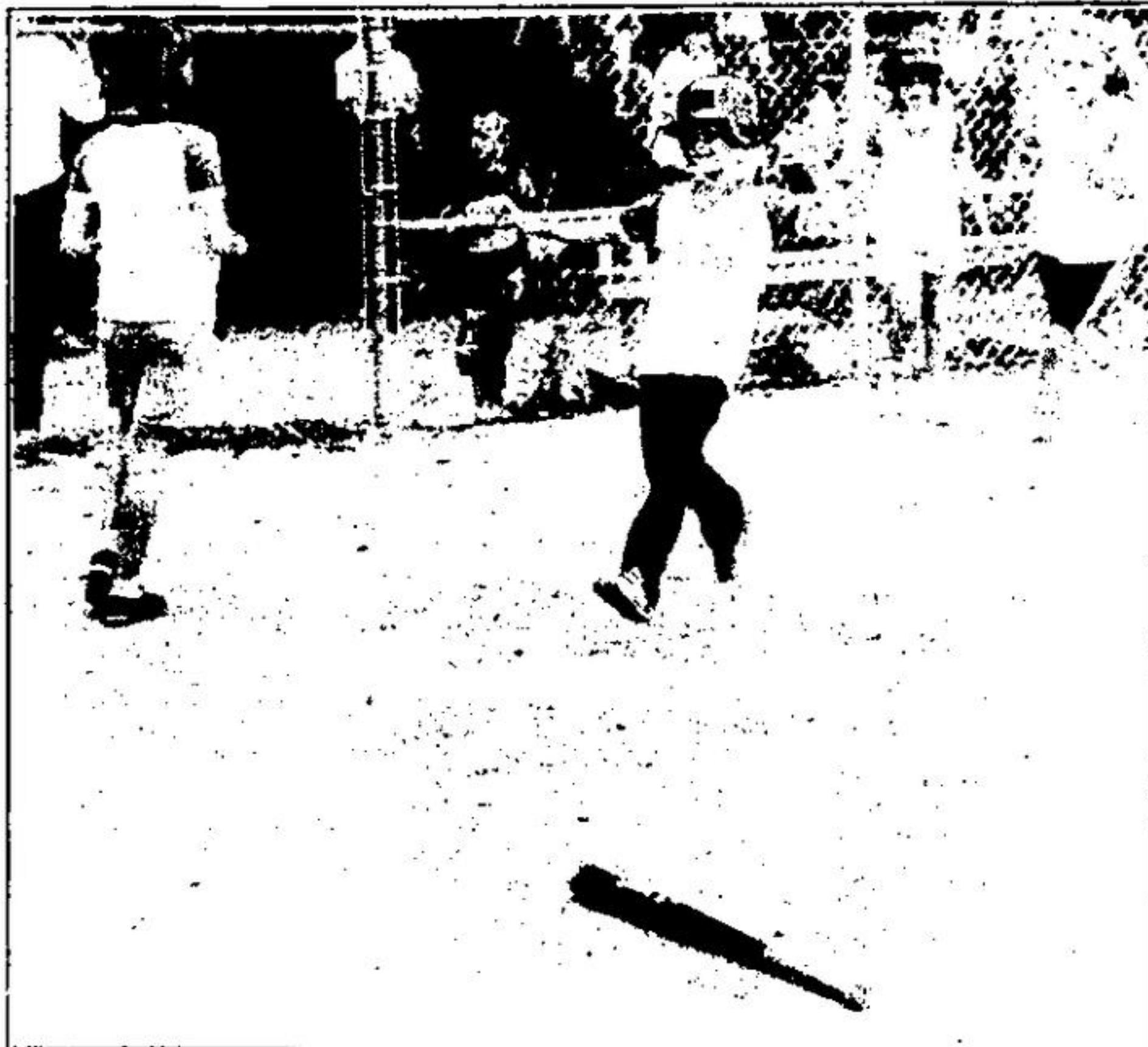
All are winners

THREE'S A CROWD. Three runs scored on this play in Kinsmen Girls Softball League Junior action, Saturday at the Fairgrounds. Everyone was a winner in the Junior division, with all players receiving a trophy.