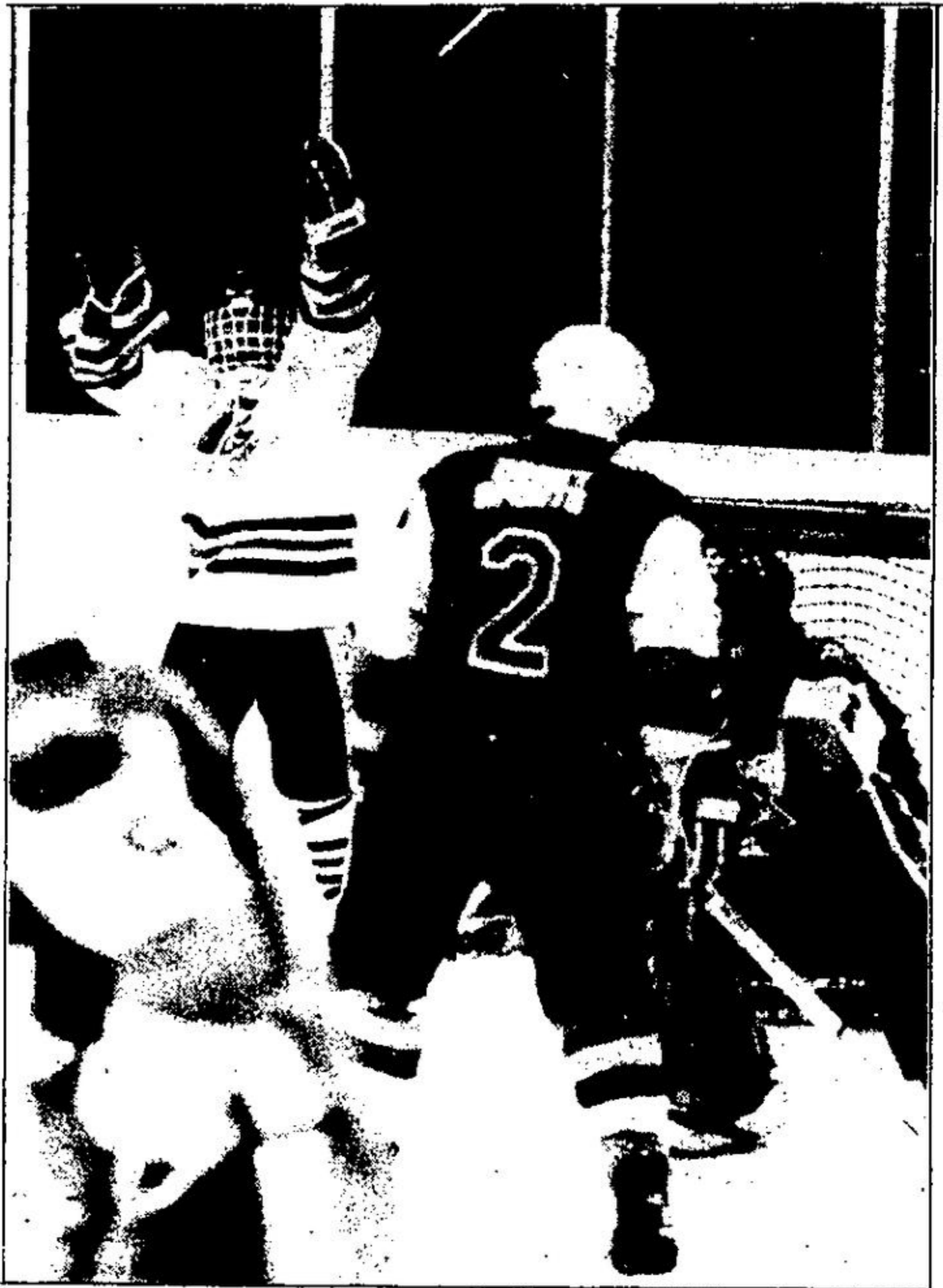
RAIDERS CELEBRATE A GOAL. This was just one of the many Georgetown Pontiac-Buick goal celebrations in Saturday's 8-2 exhibition game win over Oakville Blades. This Saturday, 7:30 p.m. at Gordon Alcott Memorial Arena, Raiders have an exhibition game scheduled against Milton.

The season home opener is set for Sept. 30, 7:30 p.m. at Gordon Alcott Memorial Arena, with Oakville Blades once again providing the opposition.