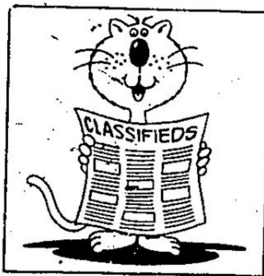
Be A Cool Cat And Check Out the Savings in the Classified Section.