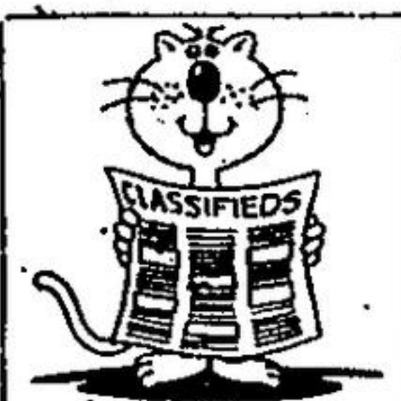
Be A Cool Cat And Check Out the Soft... in the Classified Section