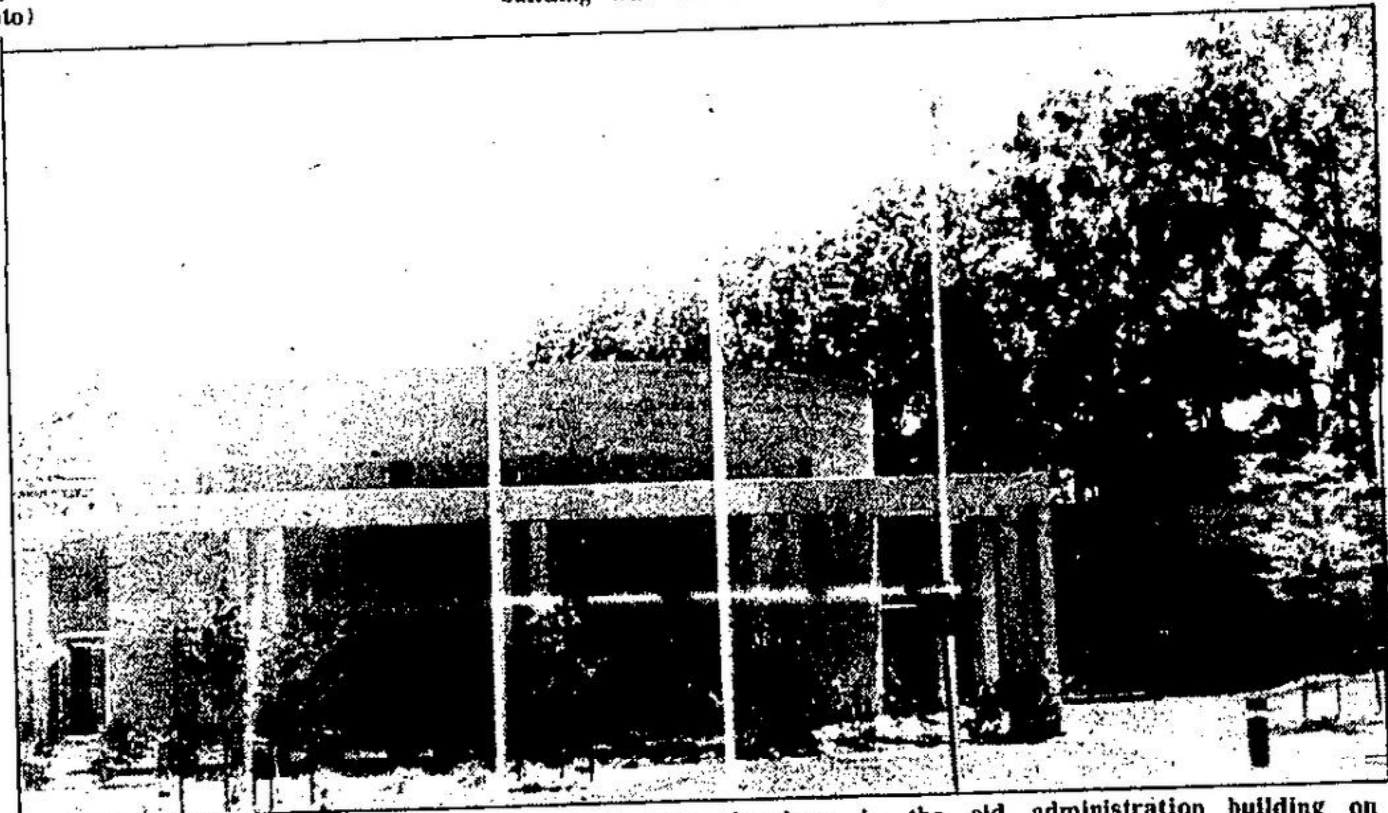
This is what the new council chambers looks like from the outside. The circular chamber can hold more than twice as many people than the council chambers in the old administration building on Trafalgar Road.