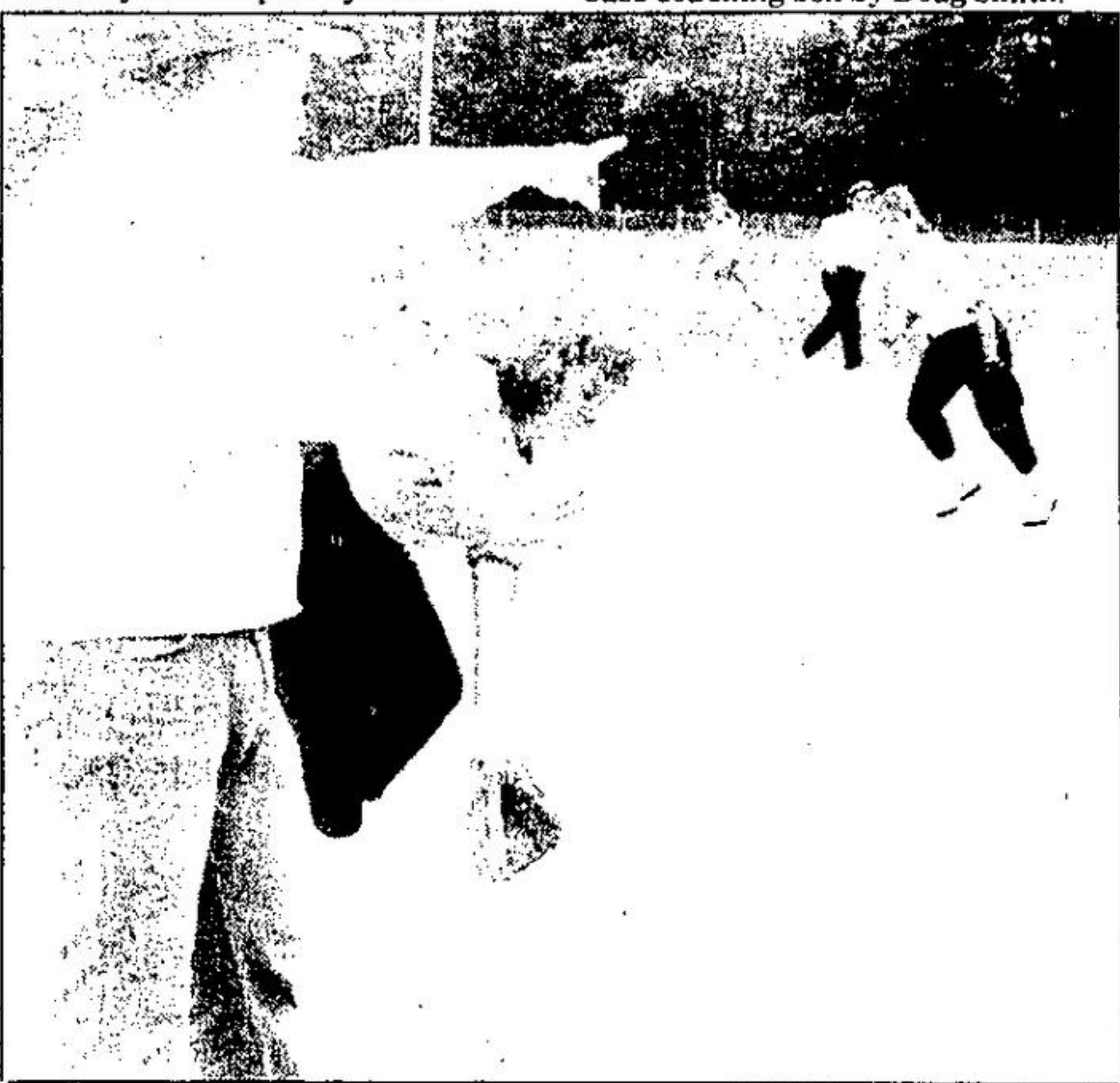
She went thataway