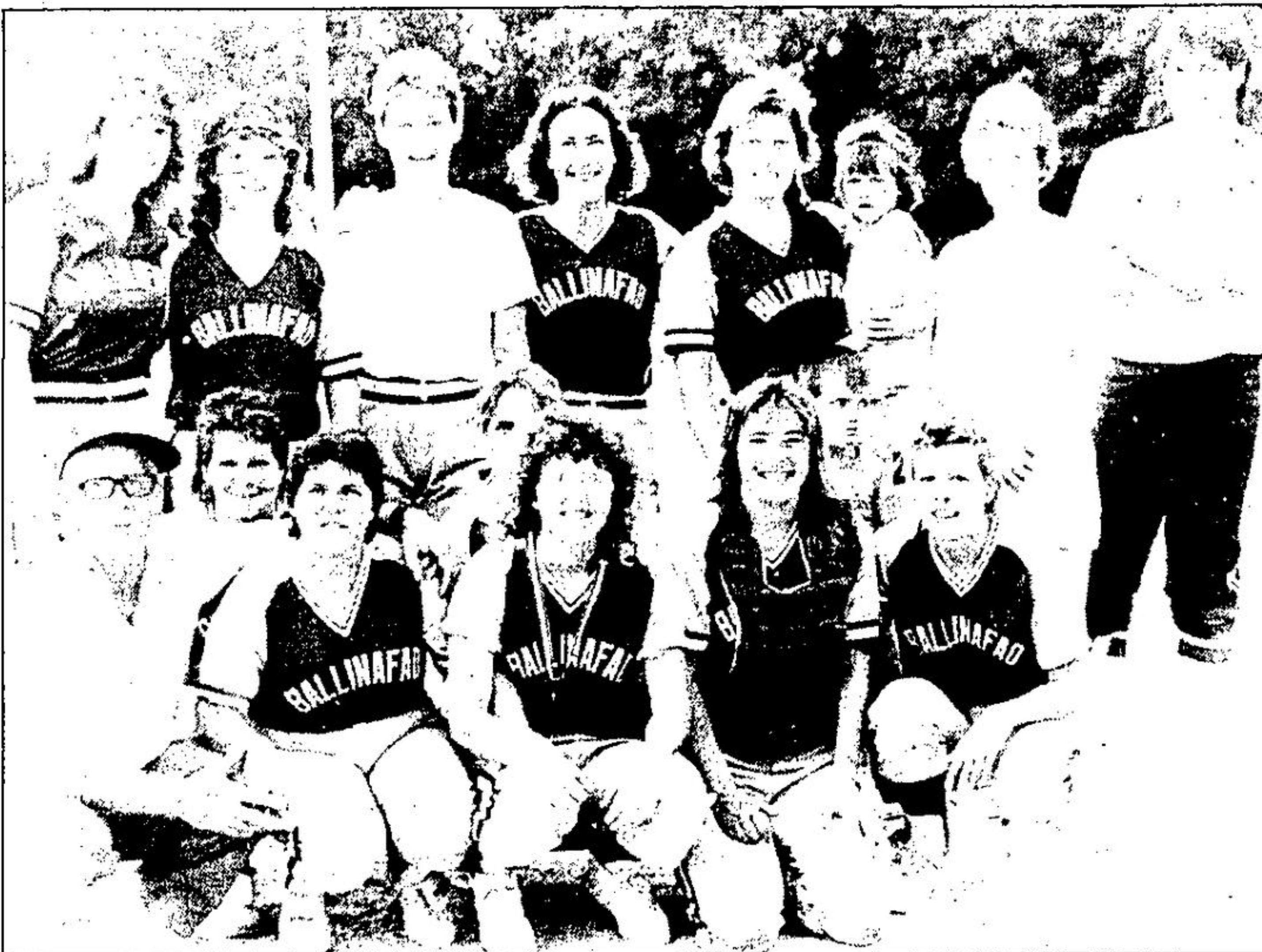
Ballinafad - top tourney team