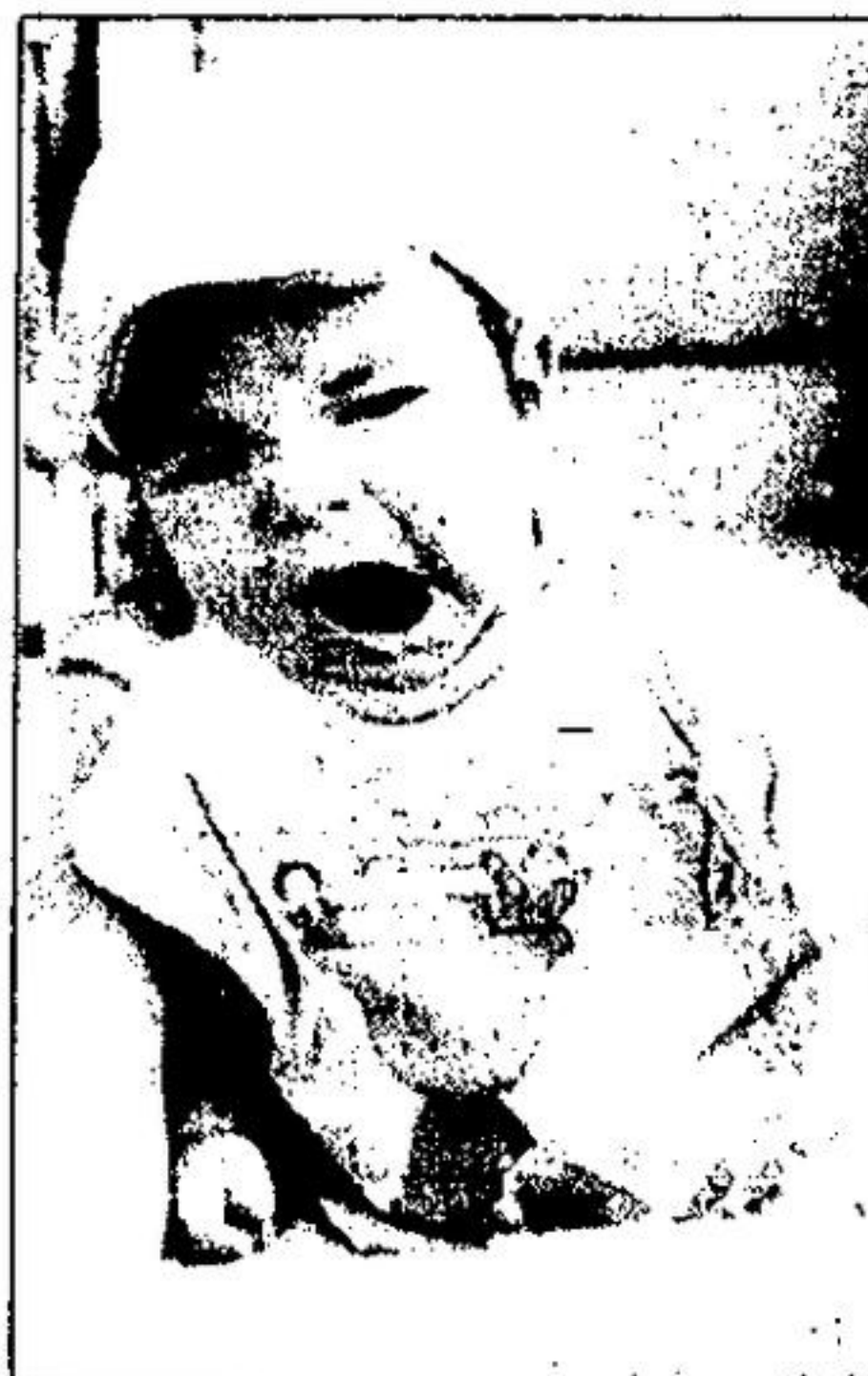
Kill the ump