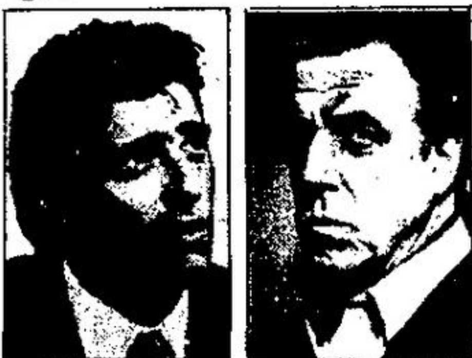
Ken Wahl Fred Gwynne

A. For "artistic reasons" — whatever that means — the show's creative forces decided to write her out. But that was accomplished in such an off-hand manner that, if they decide to, they can easily write her back in again.