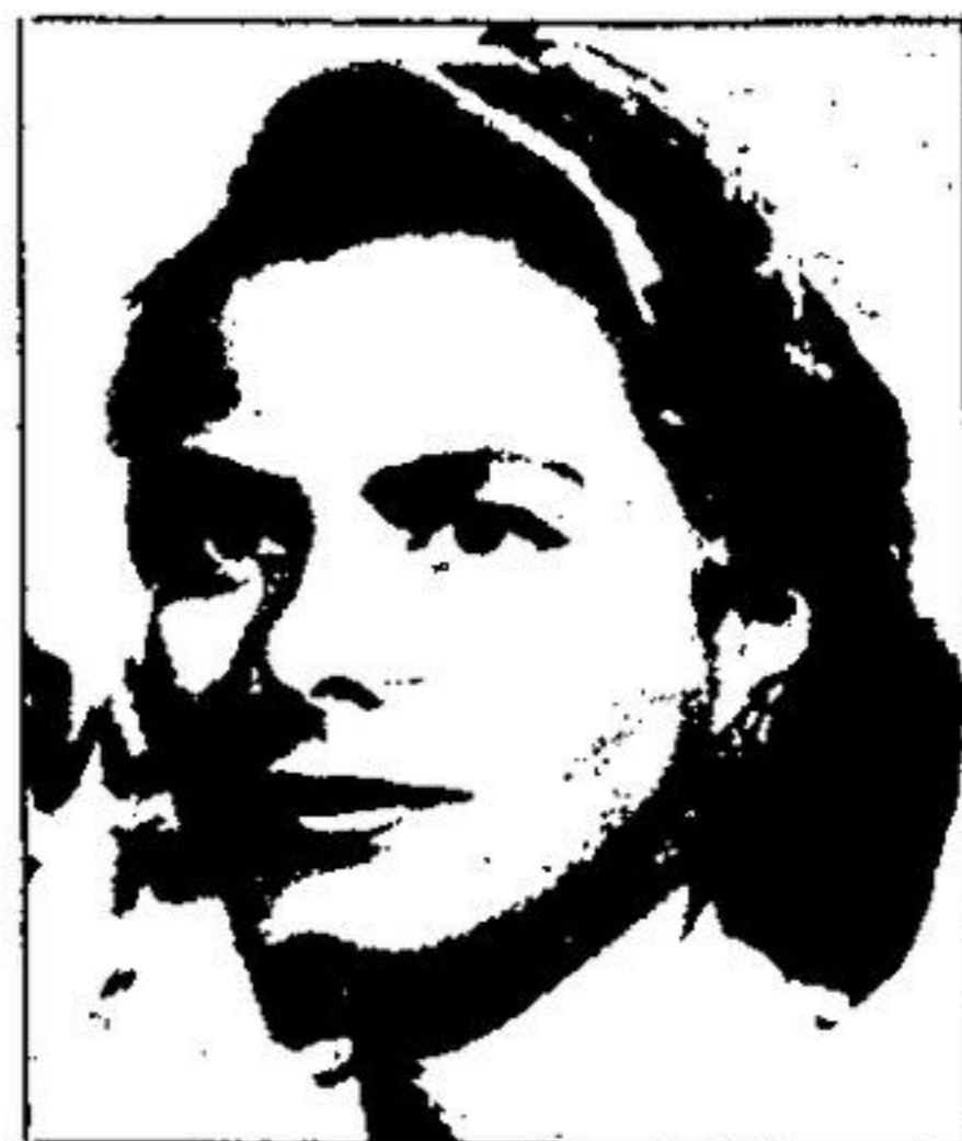
Yul Brynner and Ingrid Bergman star in Anastasia .